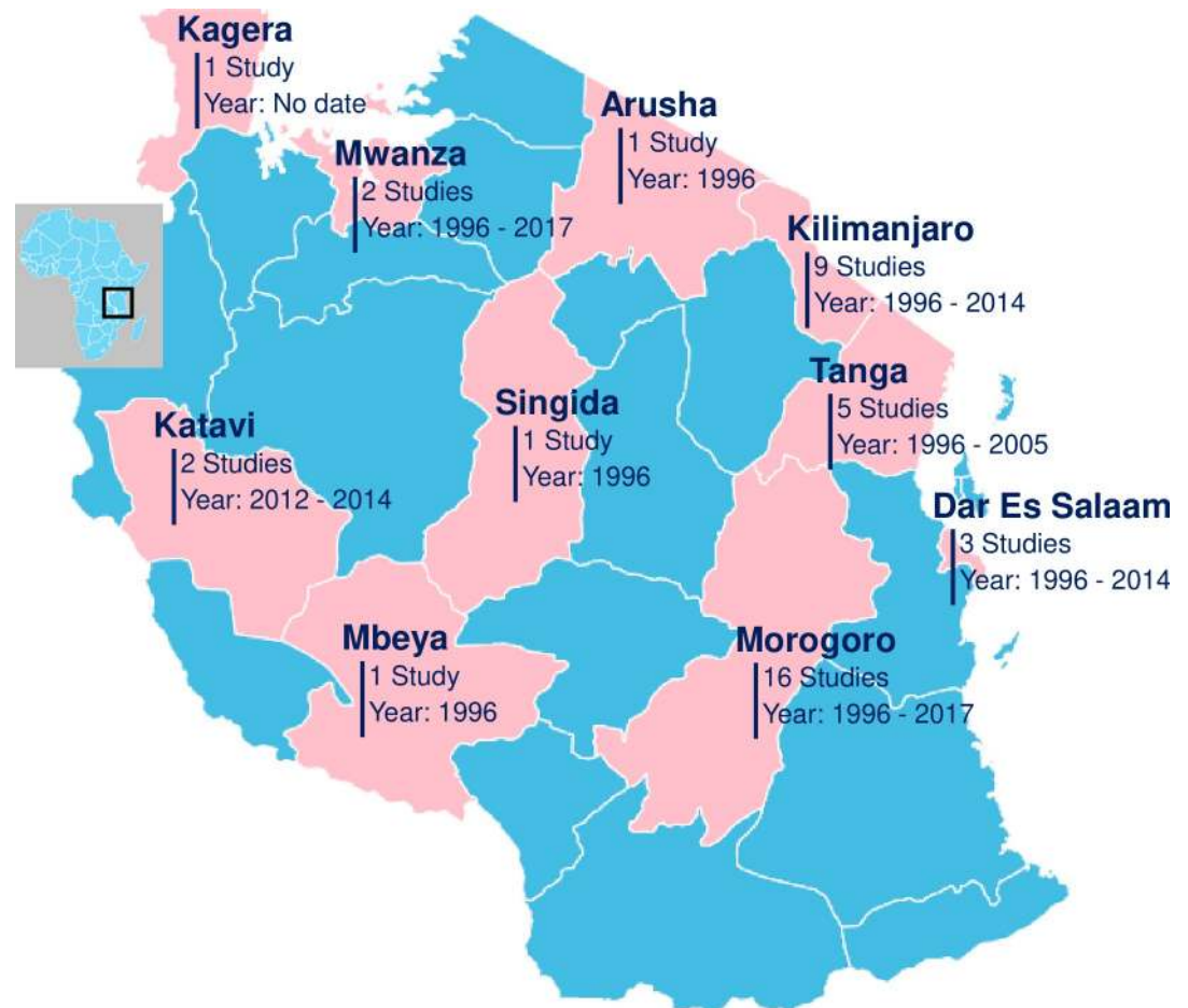
Fig 2. Geographical distribution of Leptospira studies reported from human, domestic and wild animals: Regions colored pink indicate areas with Leptospira studies from 1990s to date and regions colored blue indicate regions where no study was retrieved from the search engine. This map was prepared using Simplemaps https://simplemaps.com/resources/svg-tz .

https://doi.org/10.1371/journal.pntd.0009918.g002