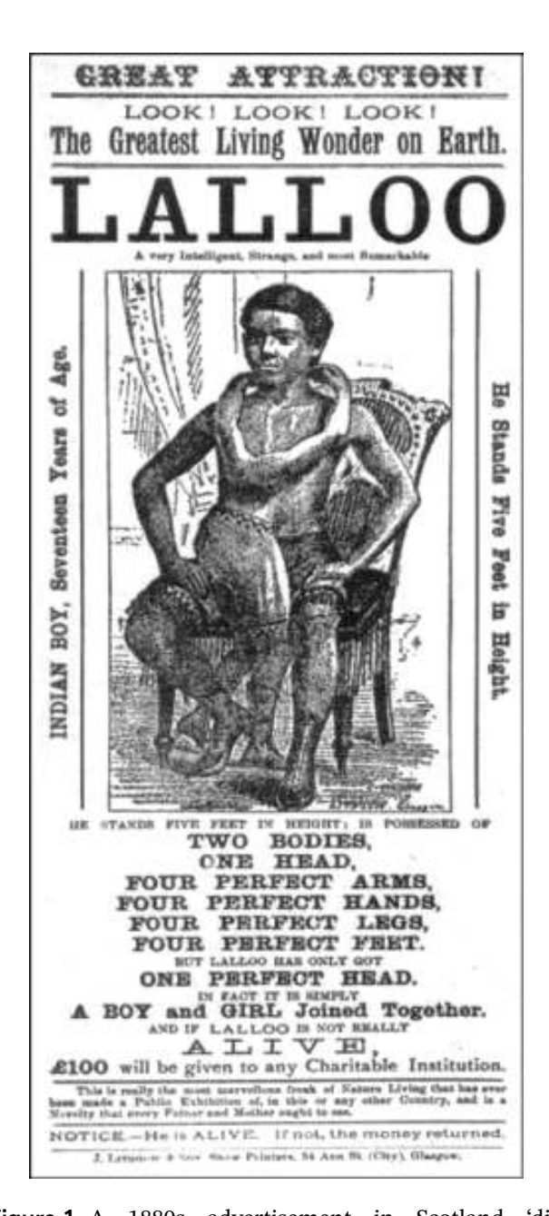
Figure 1 A 1880s advertisement in Scotland 'displaying' Lalloo, a heteropagus twin, for commercial gain. The parasitic twin, identified as a girl, was in fact the torso of a 'male' dressed and exhibited as a female.

Against such a complex, but an interesting science, we present here the report 'An account of a monster of the human species' published in the Philosophical Transactions of the Royal Society of London (hereafter, Philosophical Transactions ) from Fort St. George, Madras, on 1 Jan-