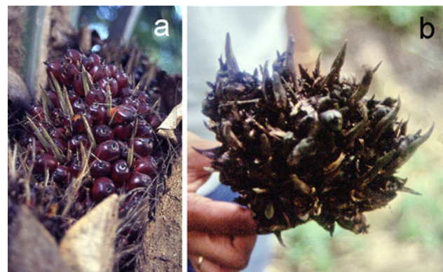
Fig. 3 A fruit bunch from a normal oil palm (a) and from a palm with aberrant, ‘mantled’ flowers (b)

way, may show an aberration in their flowers, referred to as ‘mantled’. These flowers develop a second whorl of carpels instead of stamens (Alwee et al. 2006). Most often the fruit does not develop properly (Corley et al. 1986) (Fig. 3). This causes a major financial loss, in particular as this abnormality is only detectable once palms start flowering, i.e., after 2 to 3 years in the plantation. Eeuwens et al. (2002) performed a careful study to find out which tissue culture conditions caused the malformed flowers and found that the disorder occurred more frequently in sensitive genotypes, when short subculture periods were used and when high cytokinin/low auxin was added. The disorder did not seem to be related with endogenous cytokinin levels (Jones et al. 1995). As this is typically a homeotic change, alterations in the homeotic genes that participate in the determination of floral organ identity should be considered (Alwee et al. 2006). Almost all of these are members of the MADS box transcription factor family. As the change occurs regularly, one would expect an epigenetic rather than a genetic change to underlie the abnormality. Indeed, although some genetic changes were found, these did not correlate with the occurrence of the morphological aberration (Matthes et al. 2001). Random DNA methylation changes were found among regenerated palms, and these did not correlate with the occurrence of the abnormality either (Jaligot et al. 2002).