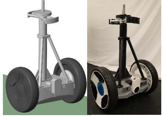
Fig. 1. CAD model & physical system, a modified Ninebot Segway.

One limitation of previous work is the learning is conducted over the full-dimensional state space, which can be data inefficient. We instead constructively prescribe a CLF, and focus on learning only the necessary information to choose control inputs that achieve the associated stability guarantees, which can be much lower-dimensional.