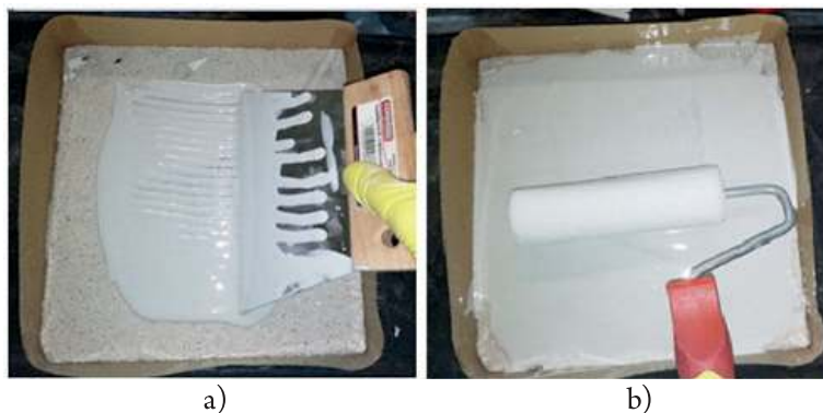
Fig. 7. Coating application

coating is presented in Fig. 7c. Both activities were performed on the cross, in perpendicular directions. The sample preparation and curing of the resin coating was performed at an air temperature of 21\pm 2^\circ\text{C} and a humidity of 50\pm 5\% .