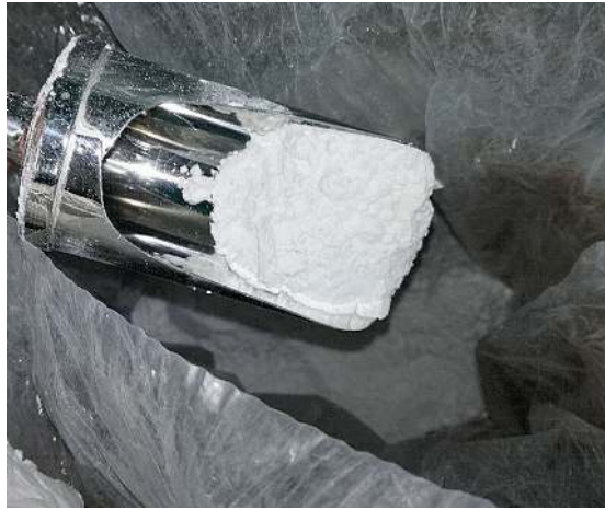
Fig. 2. Glass powder used in the research

The addition of glass powder, silicon dioxide \text{SiO}_2 , was chosen as a positive contribution to the properties of the epoxy-based coating. It is a waste material from the production of glass microspheres. \text{SiO}_2 is chemically inert; it is stable in water and at elevated temperatures. The \text{SiO}_2 compound is widely used in industry and is low cost, and glass powder as an additional waste material, the more it generates low costs. Due to its chemical composition, as well as fine graining, silica is typically economical, aesthetic and provides adhesion between the epoxy coating and the concrete substrate.