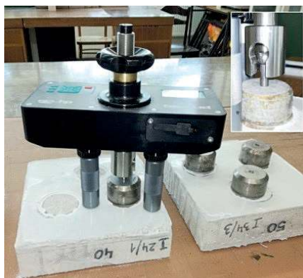
Fig. 8. A view of the test bench for pull-off testing

The pull-off test is a semi-destructive method and is performed by slight destruction of the top layer of the material. Proper preparation of the concrete surface has a very significant effect on the properties of the coating [8, 9]. A steel disc is glued to the surface to be tested by means of epoxy glue, then an incision is made around the disc to a depth greater than the thickness of the coating. After hardening of the adhesive, the disc is pulled off using a measuring device that displays the measured readings. In this study, detachment of the measuring disc always occurred at a shallow depth in concrete (Fig. 10).