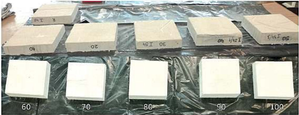
Fig. 3. Concrete substrates used in the research

thoroughly cleaned of dust. The surface of the concrete was required to be plain, but at the same time rough, which would guarantee the absorbency of the resin (Figs. 3 and 4). A graft layer was not applied.