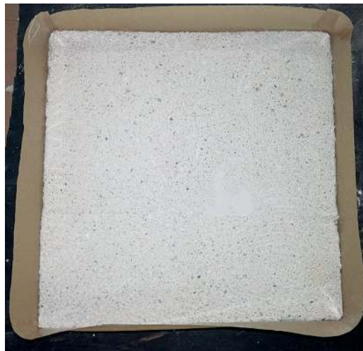
Fig. 4. Concrete substrate after the grinding process