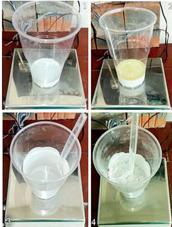
Fig. 5. The stages of preparation of the resin coating (1 – resin, 2 – addition of hardener, 3 – mixing of components, 4 – addition of glass powder)