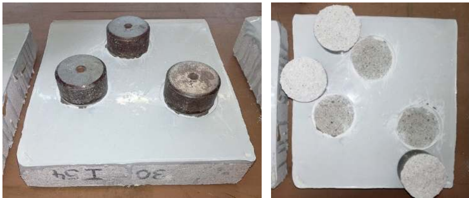
Fig. 10. View of the sample before (left) and after (right) detachment of the steel discs