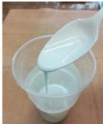
Fig. 6. Epoxy coating mixed with glass powder

The letter ‘R’ denotes the control sample (Fig. 3 and Table 1), which was coated with an epoxy coating without the addition of glass powder; numbers 10-100 indicate the weight proportions of the glass powder X content by weight to the coating components (A: B: X ). The finished mixture was spread on the surface of the foundations by means of a serrated trowel (Fig. 7a). The coating was then thoroughly vented with a paint roller (Fig 7b). The prepared