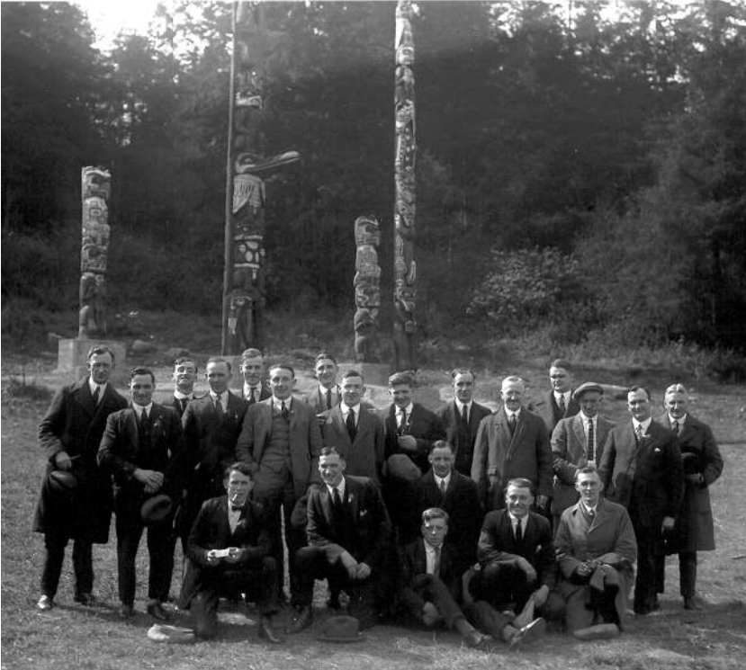
Figure 9: Canadian all-star soccer team in front of the totem poles erected near Lumberman’s Arch (subsequently moved to present location at Brockton Point) by Vancouver Parks Board after victory in BC Supreme Court in 1923. City of Vancouver Archives, CVA 99-1327.

The Parks Board’s action was not unique to Vancouver but, rather, reflected the enormous popularity during these years of romanticized Indigeneity. This was an age when anthropologists, notably Franz