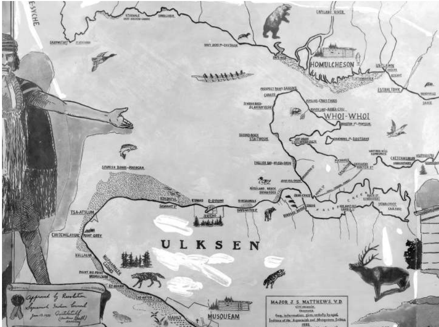
Figure 1: Major Matthews’ map of Indian sites.

The process by which indigenous people were unsettled in Vancouver was, as in Victoria, the final act in a one-sided drama whereby newcomers claimed the city for themselves – and only for themselves. The Squamish and Musqueam had long used the area’s resources. With employment opportunities in sawmills from the 1860s onwards, some sites previously seasonal in their use became more permanent villages. A map constructed in the 1930s by Vancouver’s first archivist, Major J.S. Matthews, based on conversations with elderly indigenous and non-indigenous residents about a time still in living memory, showed three dozen “Indian Names for Familiar Places,” indicating their regular usage. 13