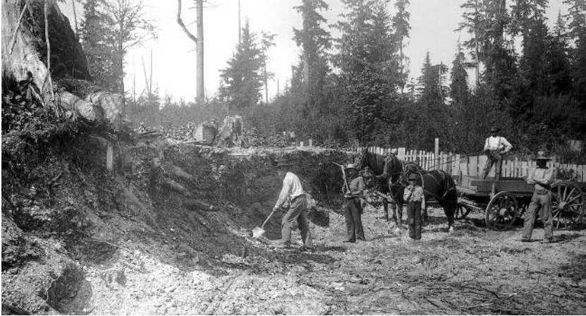
Figure 5: Middens uncovered during road building around Stanley Park, 1888. City of Vancouver Archives, SGN 91.

with the peninsula's having been supposedly set aside as a government reserve prior to British Columbia's joining Canada in 1871. While no documentation has ever been located to indicate that such a reserve had been officially created, 75 the provincial government took for granted that the peninsula had, as with Crown lands, reverted to the province on entry into Confederation. 76 Consistent with this view, a Victoria resident who, in 1875, sought "to preempt 160 acres of land" on the peninsula was informed by the province that "several persons had asked for sections of land" and that "if disposed of it would be sold at public auction." 77 The commissioner appointed by the BC government, who was personally sympathetic to the request, telegraphed the provincial commissioner of lands and works to ask "if the Prov Government would allow us to lay off a small reserve at this place" but received a negative response. 78