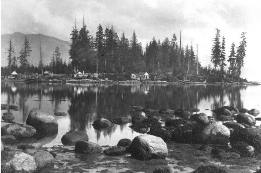
Figure 7: South shore of Brockton Point, photographed by Edouard Deveille in 1886. Library and Archives Canada, PA-06228.

The wayfarer comes upon a group of about a dozen unpainted, tumble-down shacks and sheds, with one or two cottages in a better state of preservation. On the shore in the vicinity is a jumble of logs and other flotsam and jetsam of the harbor, interspersed with the remains of boats and canoes, fallen into decay with the exception of one or two which are still in use. These shacks are surrounded by a