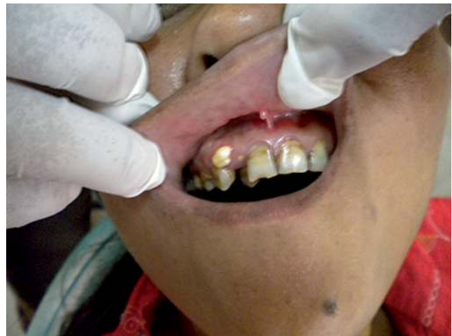
Figure 1 - Clinical photograph showing erupted odontoma

A twenty-five year old female reported to the Clinics with a complaint of a painless mass in the right side of upper jaw since five months. Patient was apparently healthy with no significant past medical and dental history. Intraoral examination revealed a yellowish white small tooth-like structure on the labial gingiva, mesio-apically to 13 measuring about 0.5×0.5 cm (figure 1). Adjacent mucosa was apparently normal and showed no signs of inflammation, infection, erythema or ulceration. The mass was labially located, non-tender, mobile and hard in consistency. Intraoral periapical radiograph revealed well defined multiple radiopaque structures located between 11, 12 and 13 (figure 2). On the basis of clinical and radiological findings a diagnosis of erupting odontoma was made. The mass was surgically removed under local anesthesia. On surgical exploration, two miniature teeth-like structured were removed along with the erupted one (figure 3). All three specimens were sent for histopathological examination. Tooth-like structure made up of enamel, dentin and cementum were reported in ground section confirming the diagnosis of compound odontoma (figure 4).