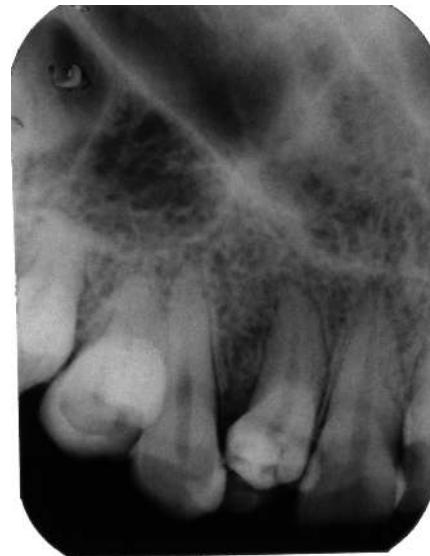
Figure 2 - IOPA radiograph showing radiopaque tooth-like structures