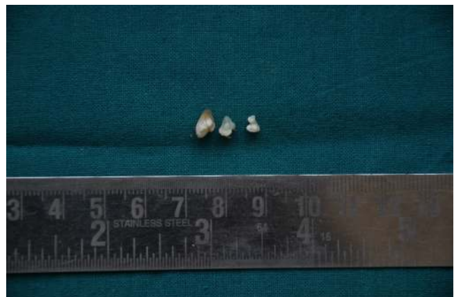
Figure 3 - Excised specimen