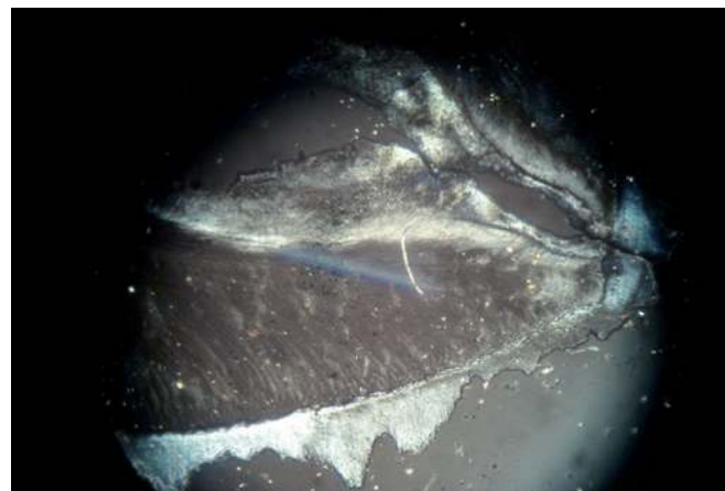
Figure 8 - Photomicrograph of ground section showing enamel rods, dentinal tubules and pulp space (10X)