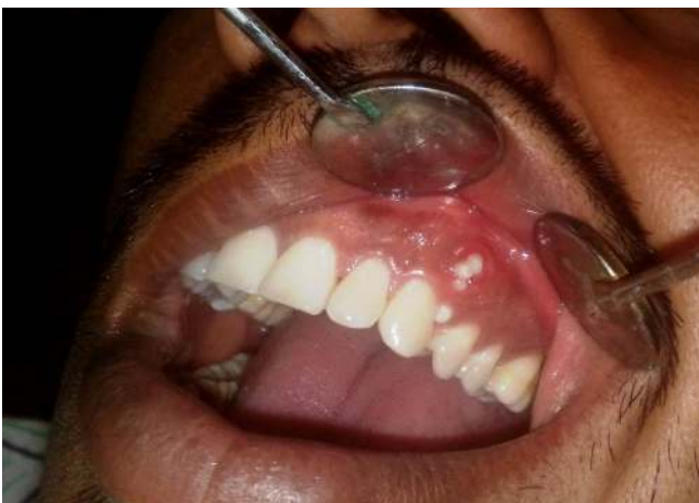
Figure 5 - Clinical photograph showing eruption of the denticles