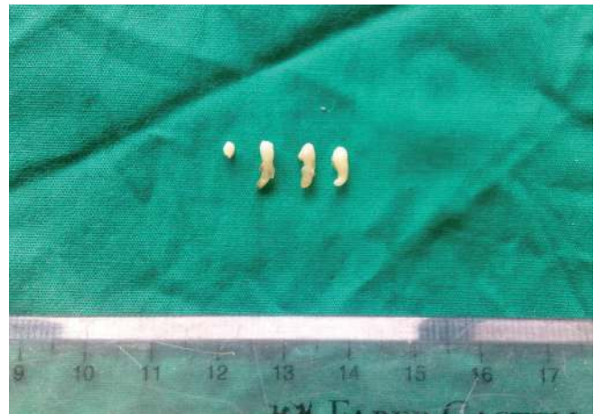
Figure 7 - Extracted surgical specimen