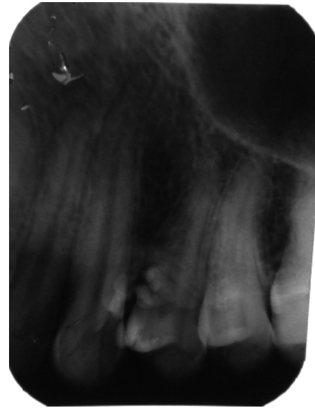
Figure 6 - IOPA radiograph showing structures of varying densities

A twenty-seven year old male patient reported with a complaint of hard structure on the left side of jaw since one year. Past medical and dental history of the patient was not significant. Intraoral examination revealed four tooth-like structures, one located in the interdental region of 23 and 24, the rest were located apically on the gingiva in the same region. No significant changes were noted on the surrounding mucosa (figure 5). The structures were hard, non tender and mobile. Intraoral periapical radiograph revealed multiple structures of varying densities between 23 and 24 (figure 6). All the structures were surgically removed under local anaesthesia (figure 7). The extracted specimens were subjected to histopathological examination, which revealed enamel, dentin and cementum with pulp space. Tooth like arrangement of dental hard tissue confirmed the diagnosis of compound odontoma (figure 8).