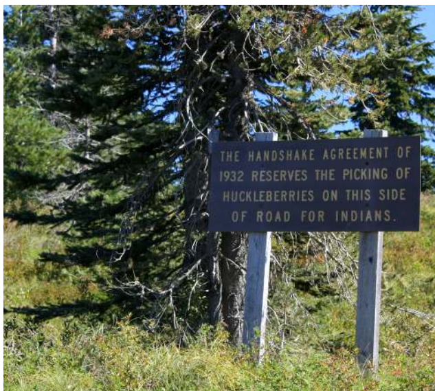
Fig. 4. A sign marks the boundary of an exclusive gathering area set aside decades ago under the “Handshake Agreement” in a part of the Indian Heaven Wilderness, Gifford Pinchot National Forest, Washington, USA.

Managing roads is important because they provide access to both tribal practitioners and nontribal recreational users who could impact tribal resources. Because roads help tribal elders to access traditional harvesting areas, they are important for facilitating the sharing of traditional knowledge with younger generations (Dobkins et al. 2016). Establishment of some tribal stewardship areas has explicitly included reopening roads to key gathering sites (LeCompte-Mastenbrook 2016).