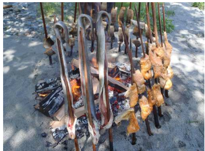
Fig. 3. A traditional tribal meal demonstrates an array of ecocultural resources, including lamprey and salmon prepared on coast redwood and western redcedar sticks over a madrone wood fire along the Salmon River, California, USA. April 2016.

The NWFP monitoring reports note that some tribal respondents regard the NWFP as having improved the condition of terrestrial and aquatic ecosystems by providing protection for old-growth forest and aquatic habitats (Vinyeta and Lynn 2015). However, these reports and research conducted with tribes (LeCompte-Mastenbrook 2016) also describe how fire suppression and minimal disturbance approaches, especially within designated wilderness areas and late-successional reserves created by the NWFP, have inhibited availability of important resources such as huckleberries and elk. Fire suppression has reduced the occurrence of both high-severity, stand-replacing fire, especially in moist forests, as well as low-severity fires, especially in dry forests (Miller et al. 2012, Reilly et al. 2017). These changes in fire