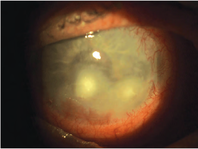
Fig. 1 - On slit-lamp examination, a corneal ulcer with a central abscess and peripheral cornea edema was noted.