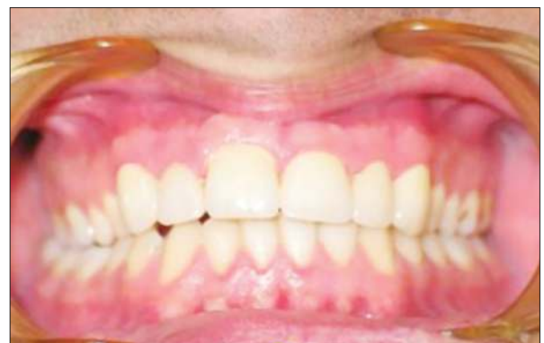
Figure 6. Frontal view of the cemented all ceramic crowns.