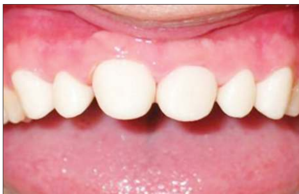
Figure 5. All ceramic cores during try-in procedure.