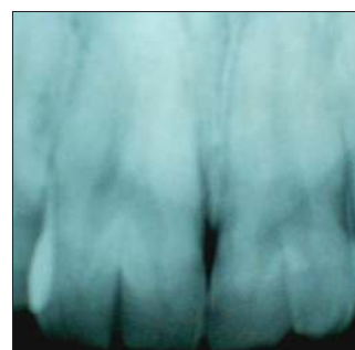
Figure 2. Periapical radiograph of the geminated incisors.