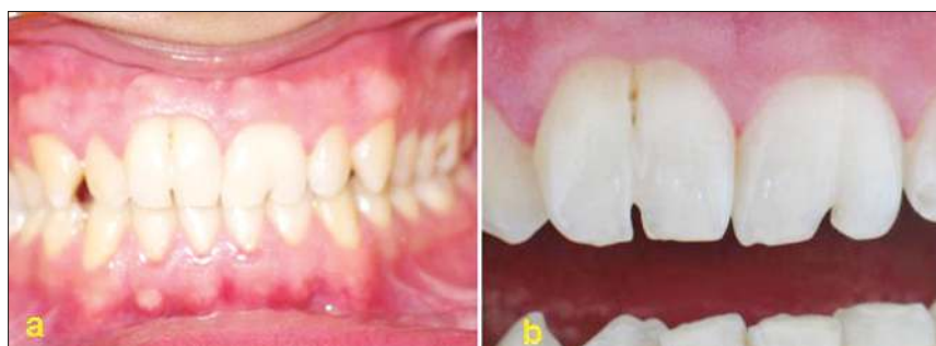
Figure 1. 1.The intraoral photographs of the case a. Frontal view of the geminated teeth b. Developmental grooves extending from incisal edge to the cemento-enamel junction

The impressions of the prepared teeth were obtained utilizing polyether based elastomeric impression material (Impregum Penta H, Duosoft Grant L, Duosoft, 3M Espe, Germany) After casting the model, all ceramic cores manufactured utilizing heat-press ceramic technique (IPS Empress 2, Ivoclar, Schaan, Liechtenstein) with # 100 lithium