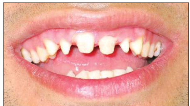
Figure 4. Frontal view of the prepared maxillary incisors and canines.