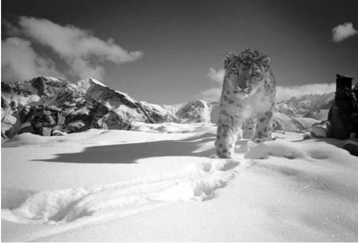
Snow leopard HNP-1, photographed on a camera-trap on a ridge 13,500 feet above Rumbak Village, Hemis National Park (HNP), Ladakh, Jammu and Kashmir, India, 3 Feb 2003. This individual, also known as Mikmar, is the dominant snow leopard of the area and was featured extensively in a public television nature film entitled, "Silent Roar: searching for the snow leopard."

spots on the snow leopard's forehead, commonly used for identification by zookeepers (Blomqvist and Nyström 1980), often were too faint or grainy when enlarged from photographs to permit individual recognition. Consequently, we relied upon those areas with shorter fur that were less prone to distortion (forelimbs) and better-defined, easily recognizable rosette shapes (flanks and tail). Obtaining good-quality side-profile photographs of snow leopards proved surprisingly difficult because most travel paths were less than several meters wide in this rugged terrain, with snow leopards typically walking close to physical objects like boulders or the base of a cliff, making it difficult to capture simultaneous images of both sides for positive identification at first capture. Furthermore, the more diffuse pelage patterns on the sides proved to be less useful for individual identification than sharply defined spots and rosettes on the lower forelimbs or dorsal tail surface. Photographs taken along travel lanes tended to produce blurry images even with fast film. We, therefore, recommend setting cameras near rock-scents or scrape sites where animals tend to linger, although cameras set to view activity at the rock-scent or scrape site will result in highly variable body poses. Potential sampling bias related to marking at rock-scents and scrapes can be reduced by placing cameras within 3–5 m from such sites.