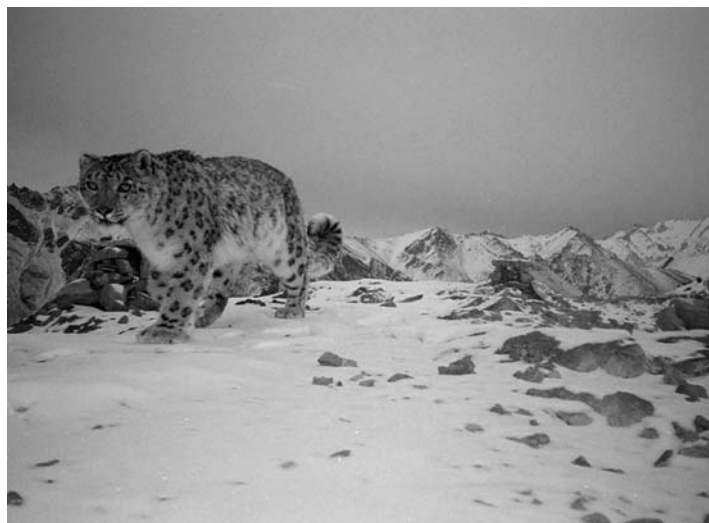
Snow leopard HNP-3, photographed on a camera-trap on a ridge 13,500 feet above Rumbak Village, Hemis Naitonal Park (HNP), Ladakh, Jammu and Kashmir, India, 19 Feb 2003.

Given the sparse populations and significant logistical constraints associated with deploying cameras over a wide area, well-conditioned population estimates and confidence limits may be nearly impossible to achieve. However, we believe that camera trapping is a viable tool for estimating snow leopard population size, at least in areas exceeding 2–3 individuals/100 km 2 . At a minimum, camera-trap surveys can yield the minimum number of snow leopards present and trapping effort (expressed as the number of animal photographs per trap night) can be viewed as an index of relative abundance provided capture probabilities remain