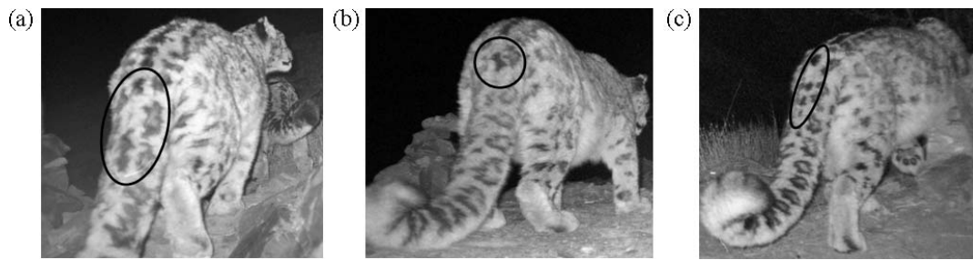
Figure 3. Examples of pelage pattern variations on the dorsal surface of the tail of snow leopards, Hemis National Park (HNP), Ladakh, India. (a) HNP-1, (b) HNP-5, and (c) HNP-7.

initial or recaptured individual was classified as a noncapture (Heilbrun et al. 2003).