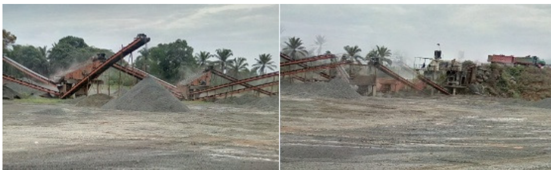
Figure 1: Picture showing quarry activities taking place in Okpoto-Ezillo quarry site in Ishielu Local Government Area of Ebonyi State.