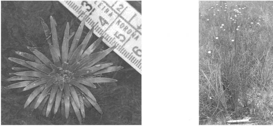
Fig. 2. A rosette (A) and three Syngonanthus nitens plants with scapes (B).

can reach up to 20 m height. In Jalapão, most of the gallery forests are swamp forests, (called veredas ) dominated by buriti palm ( Mauritia flexuosa L.f.). These swamp forests are delimited by humid grasslands ( campos úmidos ) on organosoils dominated by grass species around 0.50 m in height and characterized by the occurrence of Xyridaceae, Cyperaceae, and Eriocaulaceae, including Syngonanthus nitens . These humid grasslands occur as a belt between the scrubland ( cerrado or campo sujo ) and the gallery forest (Ratter et al. 1997). In Jalapão, they are usually between 50 and 100 m wide.