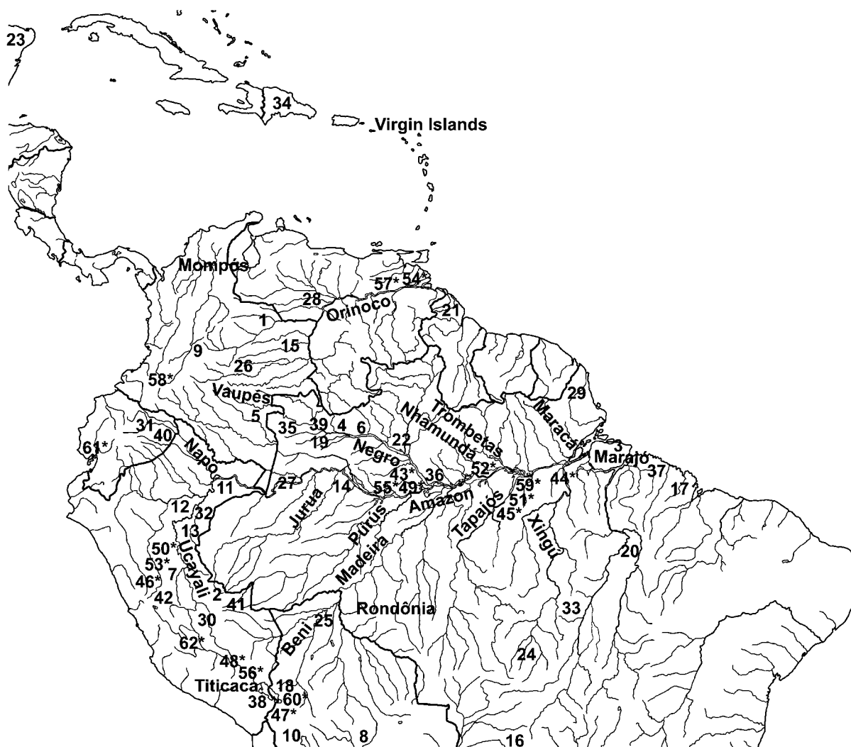
FIG. 2. Indigenous groups (1–42) and archaeological sites (43–62) mentioned in the text. 1, Achagua (Arawak); 2, Amahuaca (Pano); 3, Aruã (Arawak); 4, Baniwa (Arawak); 5, Barasana (Tukano); 6, Baré (Arawak); 7, Campa/Asháninka (Arawak); 8, Chané (Arawak); 9, Chibcha (Muisca); 10, Chipaya (Arawak?); 11, Cocama (Tupí); 12, Cocamilla (Tupí); 13, Conibo (Pano); 14, Curucirari (Tupí?); 15, Guahibo; 16, Guaraní (Tupí); 17, Ka'apor (Tupí); 18, Kallawaya (Arawak?); 19, Kaua (Arawak); 20, Kayapó (Gê); 21, Lokono (Arawak); 22, Manao (Arawak); 23, Maya; 24, Mehinaku (Arawak); 25, Mojo (Arawak); 26, Nukak (Makú); 27, Omagua (Tupí); 28, Otomac (Arawak); 29, Palikur (Arawak); 30, Piro (Arawak); 31, Quijos; 32, Shipibo (Pano); 33, Suyá (Gê); 34, Taino (Arawak); 35, Tariana (Arawak); 36, Tarumã (Arawak); 37, Tupinambá (Tupí); 38, Uru (Arawak?); 39, Wakuénai (Arawak); 40, Waorani; 41, Yaminahua (Pano); 42, Yanesha/Amuesha (Arawak); 43, Açutuba; 44, Altamira; 45, Belterra; 46, Chavín de Huántar; 47, Chiripa; 48, Cuzco; 49, Hatahara; 50, Hupa-iyá; 51, Juriti; 52, Kondurí; 53, Kotosh; 54, Los Barrancos; 55, Manacapurú; 56, Pukará; 57, Saladero; 58, San Agustín; 59, Santarém; 60, Tiwanaku; 61, Valdivia; 62, Wari.

applications of this concept to Amazonia (Hill 1996b, Schwartz and Salomon 1999, Hill and Santos-Granero 2002) have usefully reconceptualized historical processes in the area, but its ramifications for archaeology have yet to be consistently worked out. Although there are recurrent concessions to the fluidity and provision-