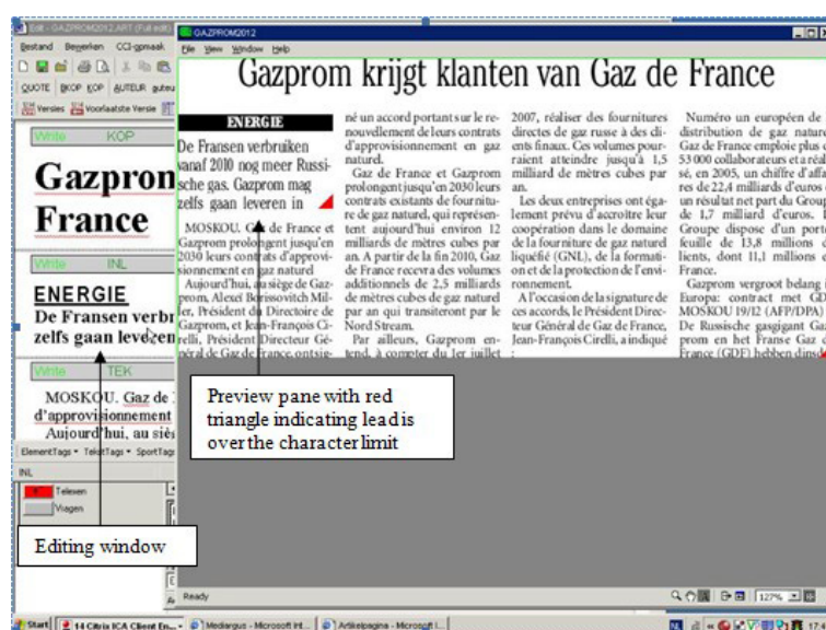
Fig. 2: Screenshot of the preview window [36]

before returning to the LR8 formulation ("This is what Gaz de France and Gazprom have agreed") in LR11. In each of these versions, Gaz de France is in first position, i.e., an equal if not more important partner, and the focus is on the economic activity of making joint business agreements. The seeds of potential threat sown in the first sentence (introduced in LR2) are thereby balanced with a sense of the normality of business transactions in which the notion of political threat is beyond the scope. LR12 sees a subtle but salient transformation as Gazprom is now placed in theme (initial) position: "Gazprom can even supply in France" (see Figure 2). Constraints of space and time, which only become visible through the mode of close micro-observation enabled by the Camtasia and Inputlog software packages thus play an intrinsic role in the representation of power relations, control and threat.