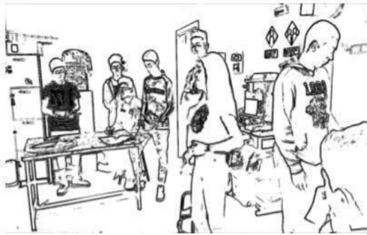
Micro-theatre performance for students in the school (Cruz, 2017)