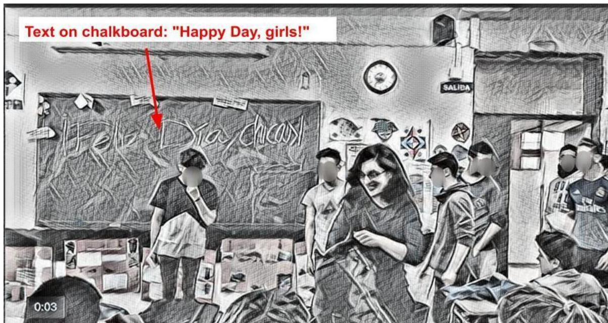
Figure 3 Preparation of a Performance in a School Classroom