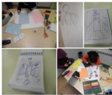
Posters created by students (Piñeiro, 2018)