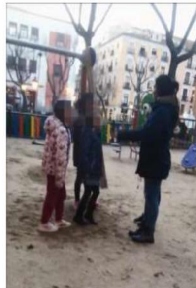
Screen-capture from children's video (Gallego, 2018)