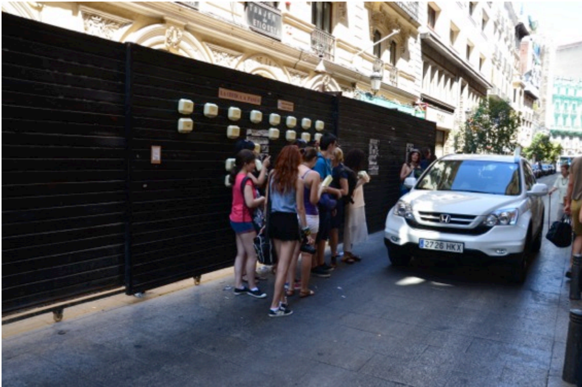
Figure 1b. 'Taking critique out for a walk', an urban gift exhibition by La galería de Magdalena (Madrid, July 6 2013).