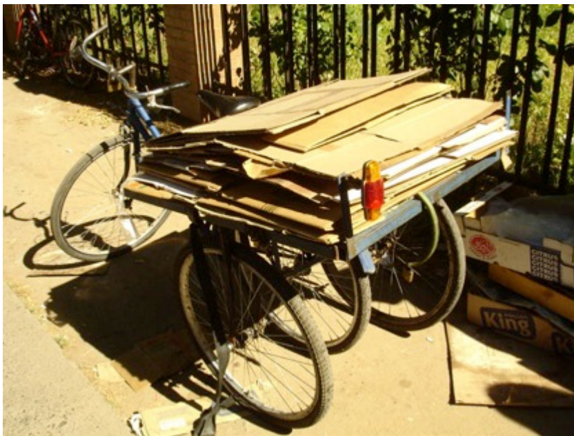
Figure 2a. Photograph of a ‘tetracycle’.

members of IC like to put it, finding ways to extrapolate and extend their technological and architectural capacities: Could the fixtures made to a bicycle-turned-‘tetracycle’ in a marketplace in Chile (Figures 2a and b) be put to a similar use in Spain? Could they be used to enhance a motorcycle rather than a bicycle? In getting ready for evolutionizing such intelligences students must learn to look out for the carrying-over capacities of material interfaces – by looking at how materials vibrate or mimetize with an environment – as well as learn to carry these vibratory qualities over to novel territories and contexts. Students must therefore develop a form of systems-thinking that is at once analogical and digital, at once capable of imagining resonances, extensions and analogies with technological appliances elsewhere and figuring out how to render them legible, how to digitize and graph them so as to enable their travelling.