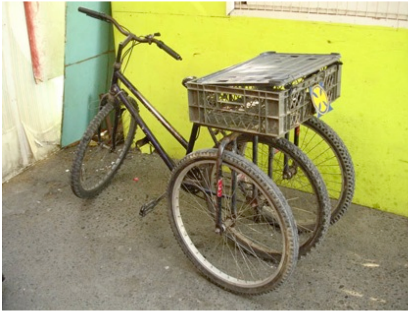
Figure 2b. Photograph of a 'tetracycle'.

In this guise, some intelligences require a multi-layered combination of iconographic techniques to be rendered fully legible, such as the use of photographs, architectural sketches, even video recordings, where the internal functioning of their components are properly explained (see Figure 3). The nature of the media formats, files and languages employed to describe an intelligence's internal pedagogics are also open to scrutiny and debate, for example, regarding the use of Autocad, a proprietary and very expensive software widely used by architects to produce 3D designs which in this form, however, restricts the circulation of designs to those with access to the technology. Open-sourcing the intelligence further requires paying attention to the social context and relations wherein the artefact or device first emerged, and at this stage it is not unusual for members of IC to engage in para-ethnographic fieldwork, interviewing the artefact's creators, providing information on their social background, their personal histories and motivations, the history of the artefacts themselves, their various versions, iterations, even their local 'evolutions', etc.