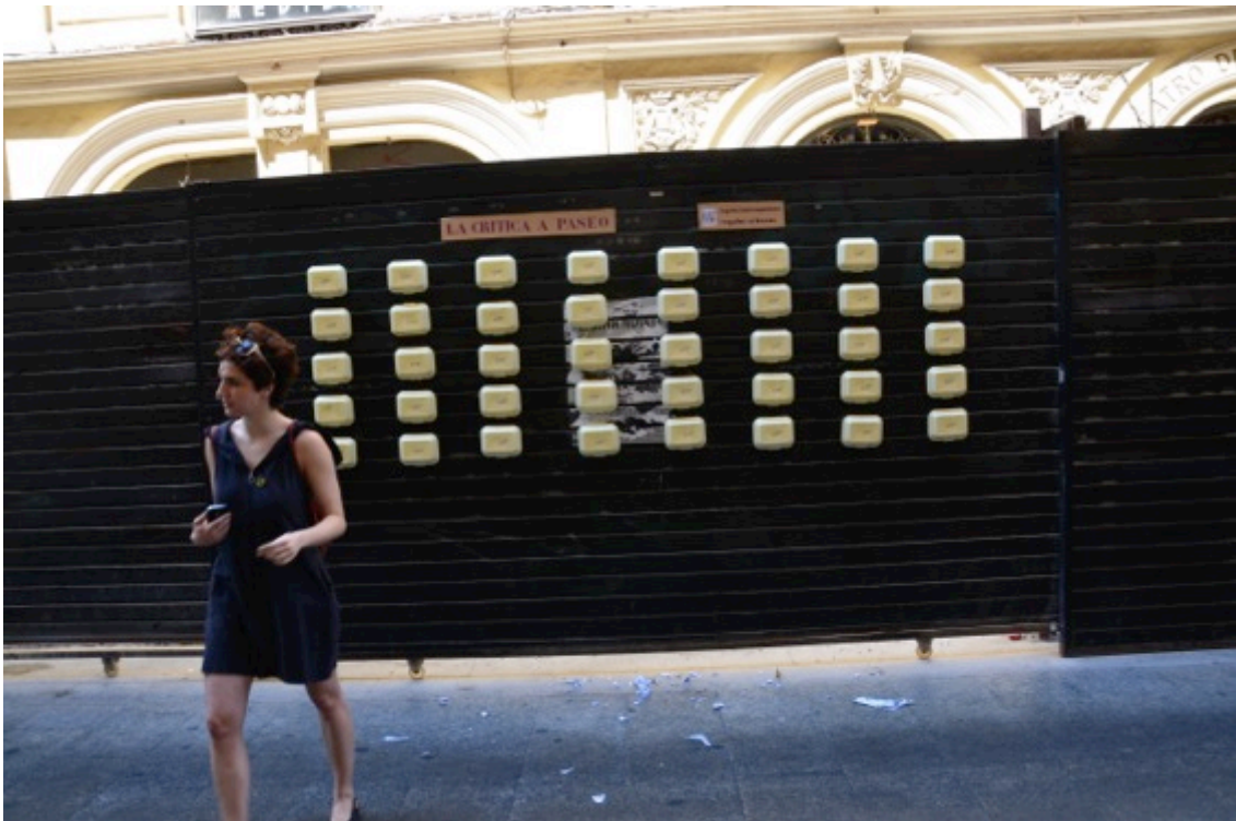
Figure 1a. 'Taking critique out for a walk', an urban gift exhibition by La galería de Magdalena (Madrid, July 6 2013).

In a wonderful turn of phrase MG speak more amply of their practice as ' regalar es curativo ', gifting is curative / curatorial, by which they mean that the liberation of the city as a material gift is both an art in the healing and re-collection of the urban condition.