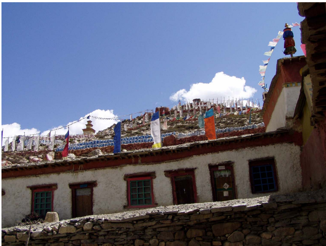
Figure 2 Monastery of Phoo

used for cough and cold, chest pain, stomachache, diarrhoea, dysentery, worms, rheumatism and gastritis and Hippophae tibetana fruit is used as a diuretic, tonic, cough and cold, to treat periods of weakness, and worms. These two species are used to treat broad range of ailments. It is very important to take immediate steps towards conservation and management aspects of these two important medicinal plants of Manang. Cultivation of these two species in the barren lands helps in conservation and management, while at the same time can improve the economic status of poorer people. Several development projects use fruits to make a now popular juice in the districts of Manang and Mustang, commonly called 'Sea-buckthorn juice'.