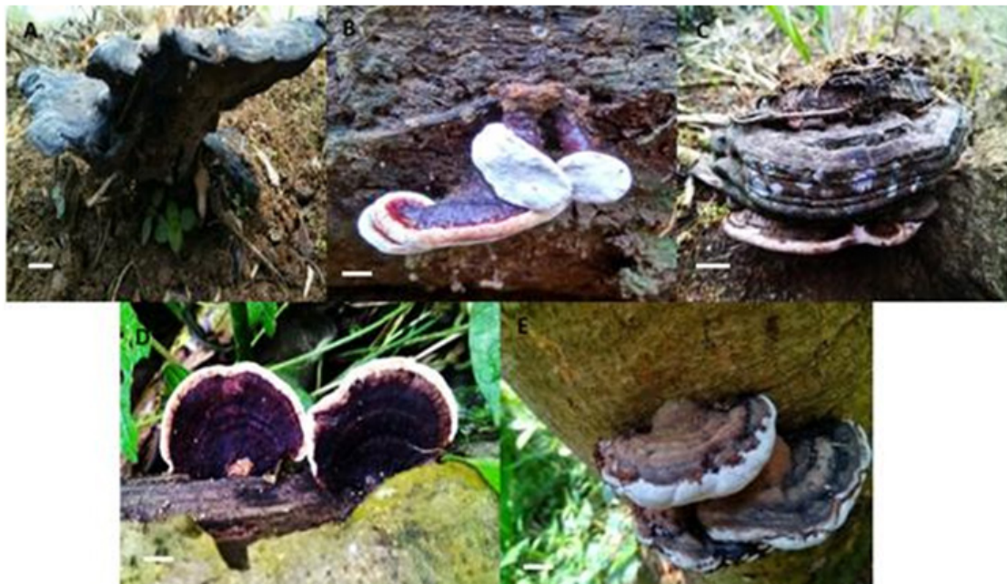
Figure 2. The Sporocarp of bracket fungi species for medicinal purposes in communities of Baduy Tribe: A. Amauroderma sp, B. Ganoderma lucidum , C. Ganoderma applanatum , D. Fomes fomentarius , E. Rigidoporus sterium , F. Phellinus linteus . Scale bar = 1 cm

age-Sundanese. Traditional knowledge related to mushrooms among Baduy people and others traditional people in the world (Santiago et al. , 2016; Teke et al. , 2018) is limited to its fruit bodies, which represent the sexual stage of their life cycle. They only recognize the bracket fungi through the sporocarp shape by their local name. The sporocarp morphology can be seen in Figure 1. Local names had very precise meanings, usually corresponding to a mycological genus, and no cases of names extending beyond a genus (e.g., to name the whole family). The names designating species of bracket fungi are made up of two words, the first word supa means “mushroom” followed by a modifier that can be an adjective or noun. These modifiers indicate the morphology of the bracket fungi sporocarp such as color, structure or substrate used by the fungi. For instance, the diversity member of Ganodermataceae family is realized by many respondents by giving the name according to the sporocarp color.