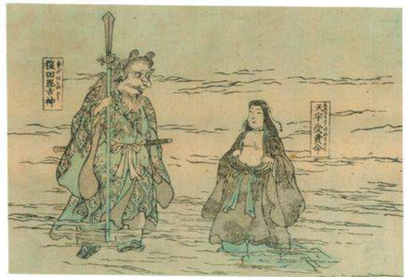
Fig. 3. The attitude of ! miya-no-Me (the right side) on the Eighth Seat of “ Hasshinden ”, drawn by Utagawa Kuniyoshi ( Ichimu D"jin [1860]: Nihon-kaibyaku-yuraiki , Vol. 2, Suwaraya Mohei Publisher)

With tardy physical appearance of attracting “harmonious fusion of human minds” of ! miya-no-Me , a warrior gathers all the metaphysical information about “Life or Death” from the opponent's reaction, and it is possible by attacking first prior to the opponent's “take the offensive”.