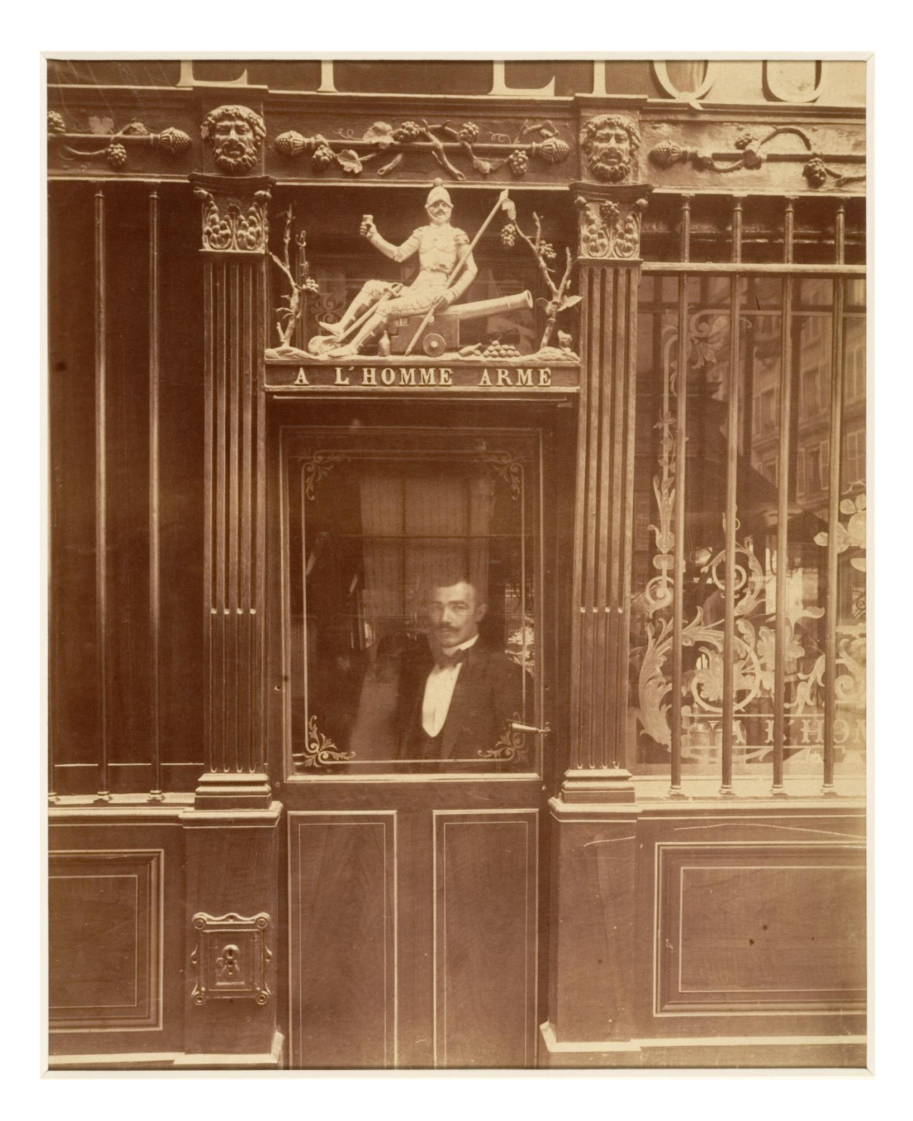
Figure 4 Cabaret de l'Homme Armé, 25 rue des Blancs-Manteaux by Eugène Atget, ca.1900. Gilman Collection, Purchase, Mrs. Walter Annenberg and The Annenberg Foundation Gift/MET Museum/WikiCommons.

There are many myths around Atget's photographs. First, that he didn't take photographs of people; in fact, he did include people occasionally in his streetscapes, and he also had a project documenting working people as well as a separate one that consisted of nudes. Second, he did not take photographs only in Paris.