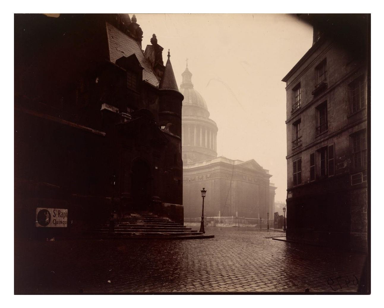
Figure 3 The Pantheon by Eugène Atget, Getty Museum/WikiCommons, 1924.