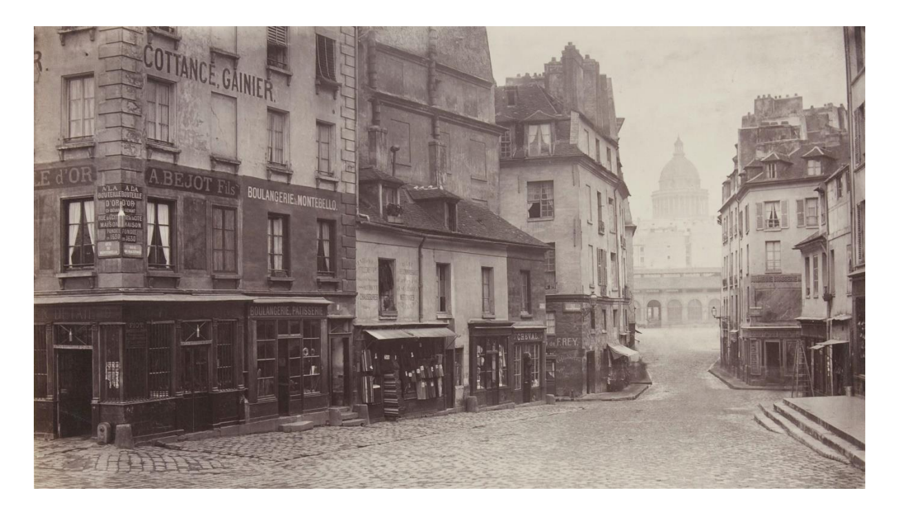
Figure 2 Rue du Haut-Pave (Pantheon in Distance) by Charles Marville, MET Museum/WikiCommons, 1865–69.