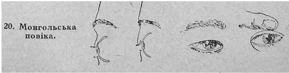
Figure 3. “Epicanthic fold.” Iendyk, Vstup do rasovoi budovy Ukrainy , 59.

Following the assassination of Bandera by a Soviet agent in October 1959, Stets’ko further strengthened his position in the OUN(b), becoming the leader of that organization in 1968. Following the Eichmann trial of 1961–62, and the Frankfurt Auschwitz trials of 1963–65, the Holocaust was slowly entering public consciousness in Bavaria, and Munich, a process that would continue over the following decades.