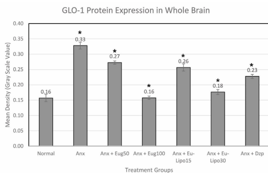
Figure 3. Quantification of GLO-1 immunohistochemical images in gray scale value in different treatment groups (* p < 0.001 ).

the animals treated with diazepam at the dose of 1 mg/Kg (Figure 2G). This group was used as a positive control. The results of IHC images were analyzed by calculating the mean density (gray scale value) of images by Nikon Elements-D software as shown in Figure 3 Through this method, the IHC results were quantified and validated.