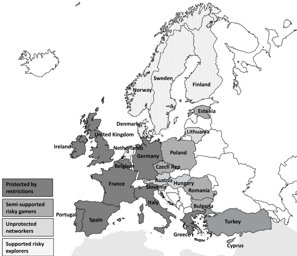
Figure 2: Mapping children’s online experiences by country