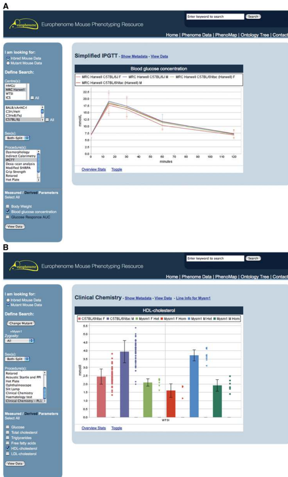
Figure 1. This interface shows the results of two queries using the Phenome Data Viewer. (A) The query builder menu on the left-hand side and the results panel on the right which displays a line graph of Blood glucose concentration from the Intraperitoneal glucose tolerance test (IPGTT) procedure performed on inbred mouse strains C57BL/6Ntac and C57BL/6J. (B) The same query builder for mutant data on the left-hand side and on the right, the bar chart graph of HDL-cholesterol for the Mysm-1 mutant.