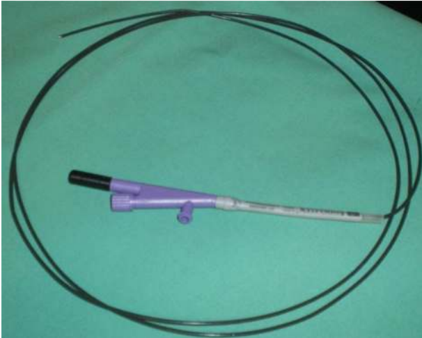
FIGURE 1: 6F cystostome (Endoflex company).

38X, EG 38UT, and EG 3870UTK) were developed by Pentax-Hitachi. The FG 38X has a working channel of 3.2 mm, which allows the insertion of a 8.5F stent or nasocystic drain and the EG38UT and EG3870UTK have a larger working channel of 3.8 mm with an elevator allowing the placement of a 10F stent [1, 2].