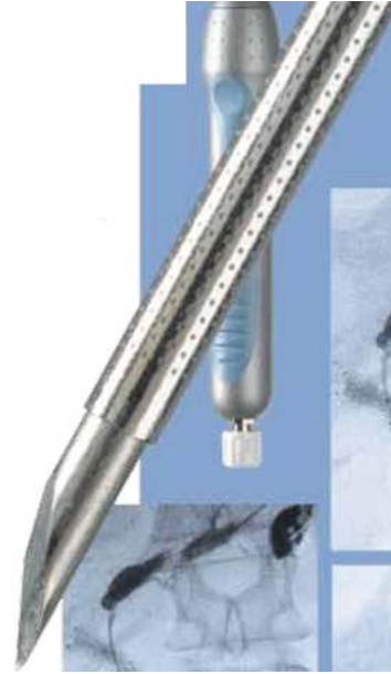
FIGURE 2: Echotip “ACCESS NEEDLE” Cook company.

A standard endosonography fine needle aspiration (FNA) needle is well visualized sonographically and can be used for pseudocyst puncture. The drawback of this needle is the small caliber (22 or 23 G) that will accept only a 0.018-inch guidewire. Using a 19 G FNA needle (Wilson-Cook Corporation), a 0.0035-inch guidewire can be inserted through the needle into the dilated bile duct. Wilson Cook Corporation has recently developed a “new access needle”; However, one of the main problems during these new techniques of hepaticogastrostomy, is the difficulty manipulating the wire guide through the 19-gauge EUS needle. The main trouble was the “stripping” of the coating of the wire, which in turn created a risk of leaving a part of the wire coating in the patient and also the impossibility to