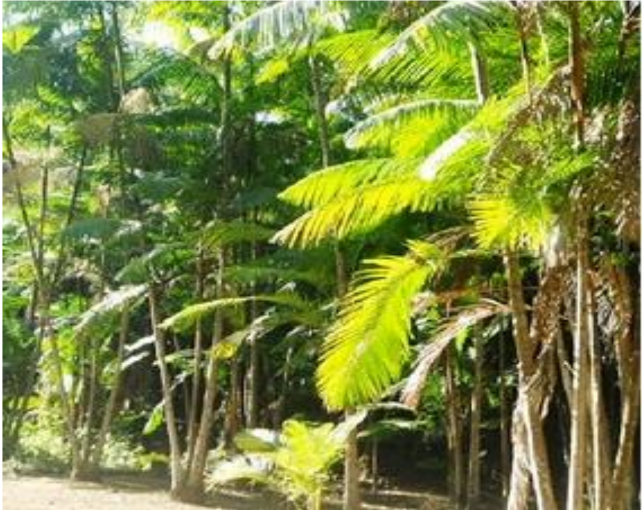
Figure 2. A plantation of Euterpe oleracea Mart (açai) palm tree in the Recanto Santa Clara, located at -0.96039 N; -51.268450 O, Mazagão, Amapá, Brazil.