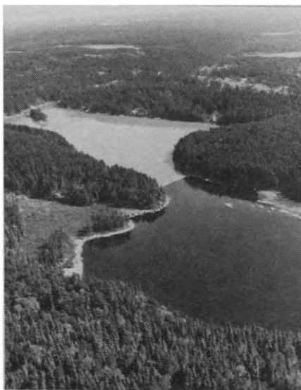
Fig. 1. Lake 226, demonstrating the vital role of phosphorus in eutrophication. The far basin, fertilized with phosphorus, nitrogen, and carbon, was covered by an algal bloom within 2 months. No increases in algae or species changes were observed in the near basin, which received similar quantities of nitrogen and carbon but no phosphorus.

In an early experiment, phosphate and nitrate were added to lake 227,