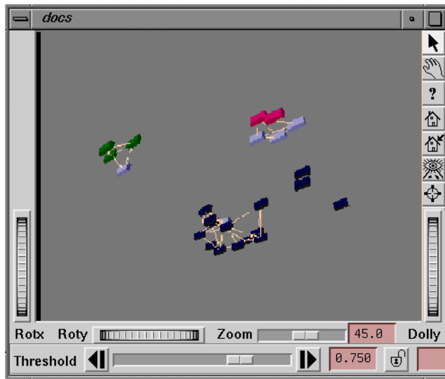
Figure 2. The 3-D Window

dimensional space (approximately 400,000 for this collection) where each dimension corresponds to a feature in the collection and the distance was measured by the sine of the angle between the vectors. That space was collapsed to 3 dimensions for visualization using a spring embedding algorithm[12]. The interface included a slider for adjusting the threshold that determined the tightness of the generated clusters. The resulting visualization is similar in style to BEAD[4], differing in a few key aspects: BEAD was used on an entire (though small) corpus, and this display is used only on the retrieved set; the vectors used by BEAD were based on document abstracts but the vectors used by this display are based on full text.