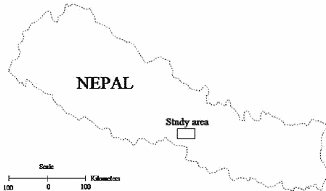
Fig. 1. Location of study area in East Chitwan, Nepal

Wildlife Conservation Act, passed in 1993, gave the Department of National Parks and Wildlife Conservation (DNPWC) the legal power to establish buffer zones in forested areas surrounding parks where forest resources are used on a regular basis by locals (Heinen and Mehta 1999, 2000). The DNPWC began implementing the Park People Program in the Chitwan and in other protected areas of Nepal in early 1995, to fulfill two primary objectives: socioeconomic wellbeing of the buffer-zone communities and biodiversity conservation of the parks and their surrounding forests (Maskey et al. 1999). This program receives financial and technical assistance from the United Nations Development Programme (UNDP), and has since been rechristened the Participatory Conservation Project.