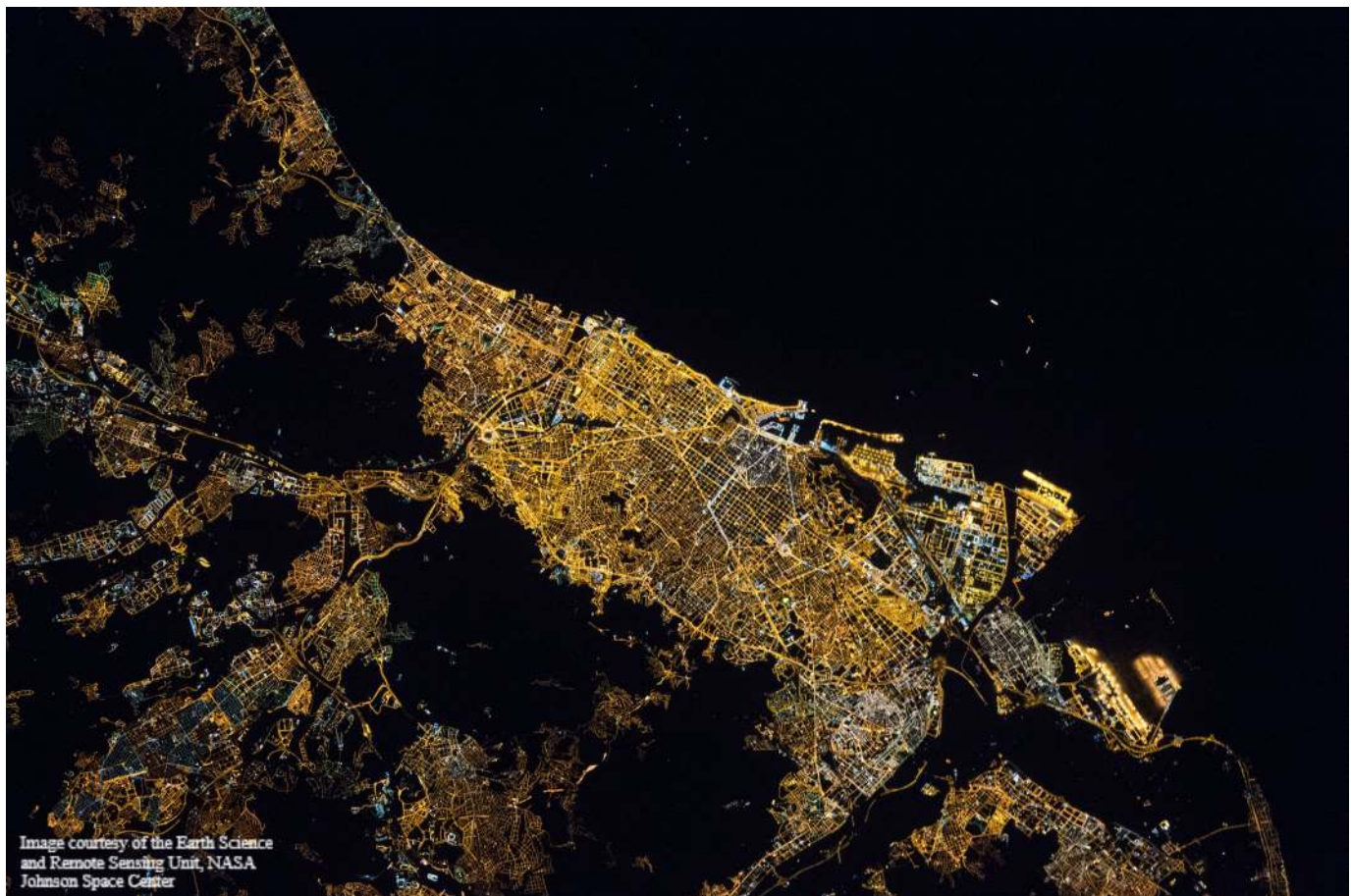
Figure 2. International Space Station night image of Barcelona 18 April 2013, time: 22:10:46 GMT (local time 00:10:46) (ISS035-E-23385; NASA Johnson Space Center; https://eol.jsc.nasa.gov ).

designed to scale the spectral interaction between a given light spectrum and the published measurements of the melatonin suppression action spectrum (MSAS) (Brainard et al. 2001; Thapan et al. 2001). The MSI has been designed to separate the effect of the shape of a spectrum from its averaged luminous intensity by making use of the MSAS. The MSI determinations were done for the house location of each participant involved in the study and derived as a number generally ranging from 0 to 1. The MSI represents to what extent the spectrum shape of different lights are efficient to suppress the melatonin production compared with the spectrum shape of the International Commission on Illumination (CIE) illuminant D65 that has been arbitrarily set to the highest value (one). The CIE Standard Illuminant D65 corresponds approximately to the average midday sunlight in Western and Northern Europe.