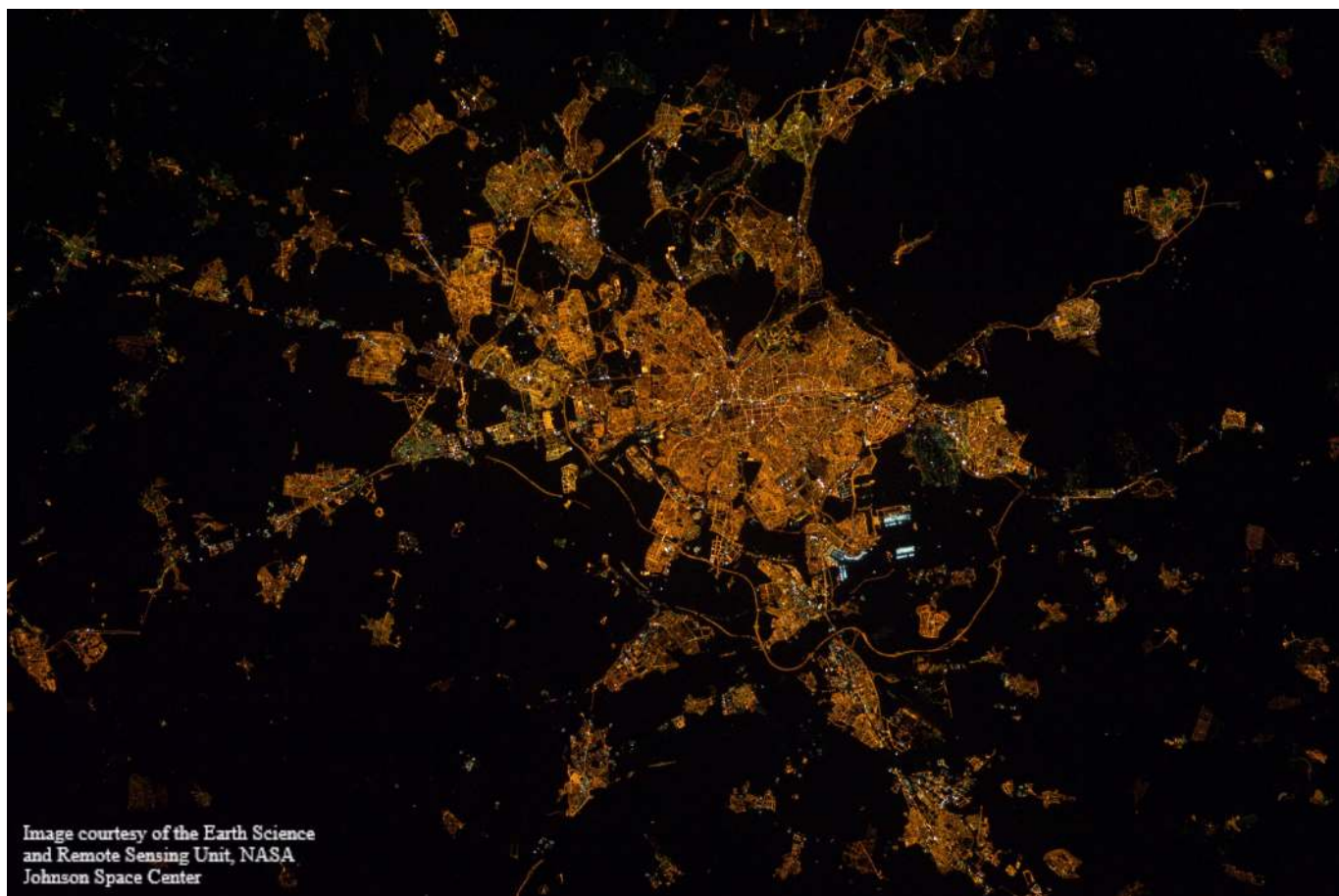
Figure 1. International Space Station night image of Madrid 12 February 2012, time: 02:22:46 GMT (local time 03:22:46) (ISS030-E-82052).

We also calculated an index of outdoor blue light spectrum using an approach described in Aubé et al. (2013) to calculate the melatonin suppression index (MSI) at each pixel of the image. The MSI is related to exposure to blue light and is a metric