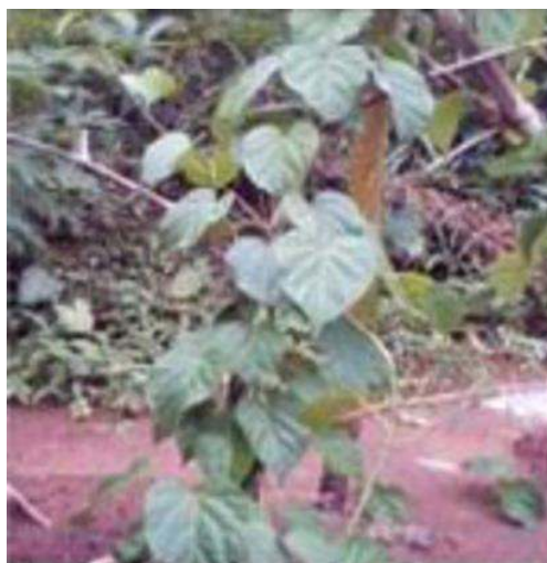
Figure 1 The plant of Gongronema latifolium

African medicinal plants such as Gongronema latifolium are known for both nutritional and medicinal value. The tropical rainforest plant Gongronema latifolium (Utazi) belongs to the Asclepiadaceae family and to the genus Gongronema [19]. It is an edible plant which, when cut, produces milky latex with a green leaf, yellow flower and stem. In particular, when eaten fresh, it has a distinctive sharp, bitter and slightly sweet taste.