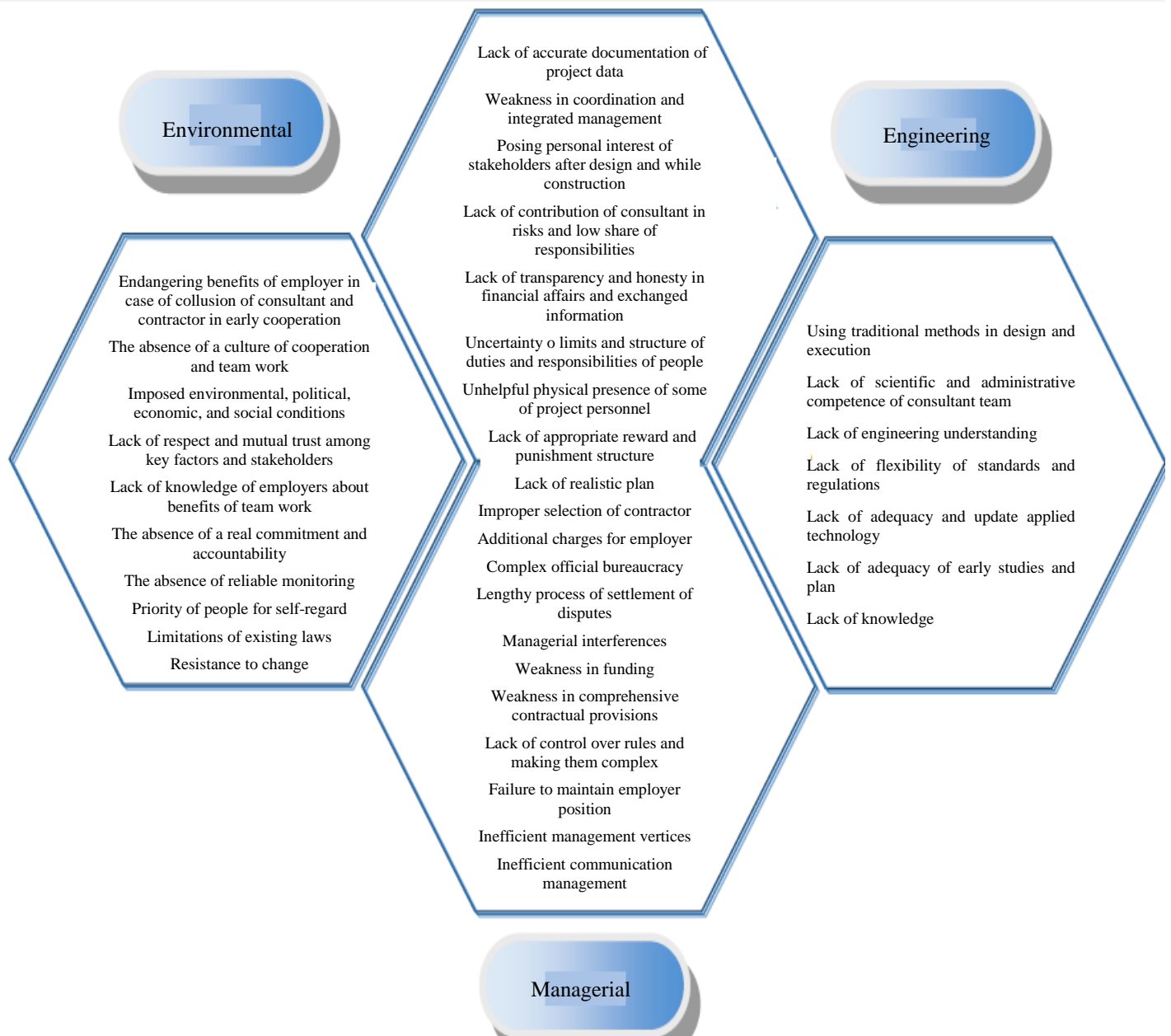
Figure 3. The barriers to proper implementation of constructability in Iran

According to what is done through interviews with consultants and owners and contractors in the field of Mass Housing industry in Tehran, some barriers were identified by interviewees, which are shown in the Figure 2 as follows.