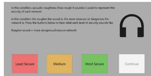
Figure 1: Condition introduction page where the data-to-sound mapping is explained, including the polarity. Three coloured buttons allow the participant to hear the sound for each level of security.

Each block consisted of three trials. At the beginning of each condition, participants were presented with a screen which explained the acoustic parameter being used in that block and how it was mapped to each level of network security (Figure 1). In this screen, participants could use the three coloured buttons to hear the sound cues for each level of security for the given condition’s data-to-sound mapping. Participants could not press the continue button until the button for each level of security was pressed at least once, however they could listen to each sound cue as many times as they needed. In each trial, participants were presented with a screen showing three WiFi networks, each with a button to play the sound cue to convey their level of security (Figure 2).