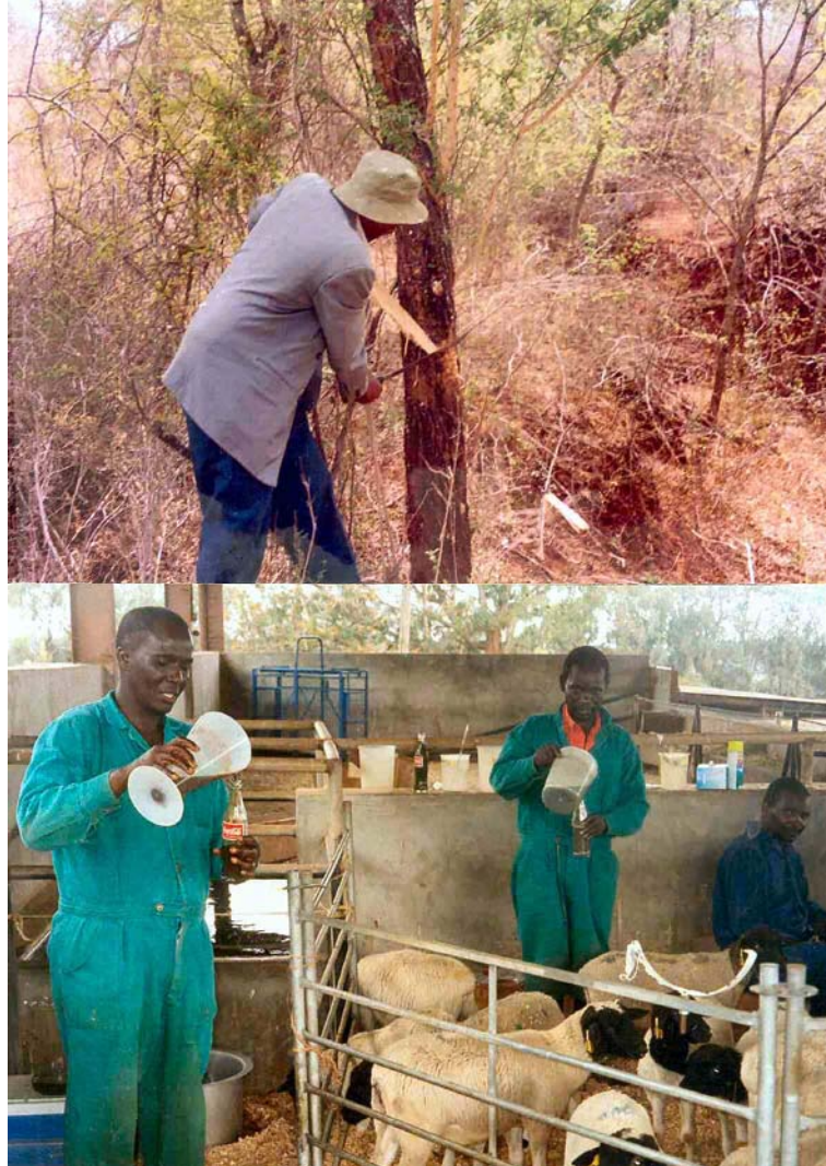
Fig. 3. A small holder farmer from the Machakos district harvesting strips of Albizia anthelmintica bark using a machete (top), and administration of a plant preparation using the methods and quantities used by traditional healers (bottom).

The mice preparation for R. melanophloeos was prepared in a similar manner to that of M. africana , with the resulting dose of 4 g kg -1 bwt (Paper III).