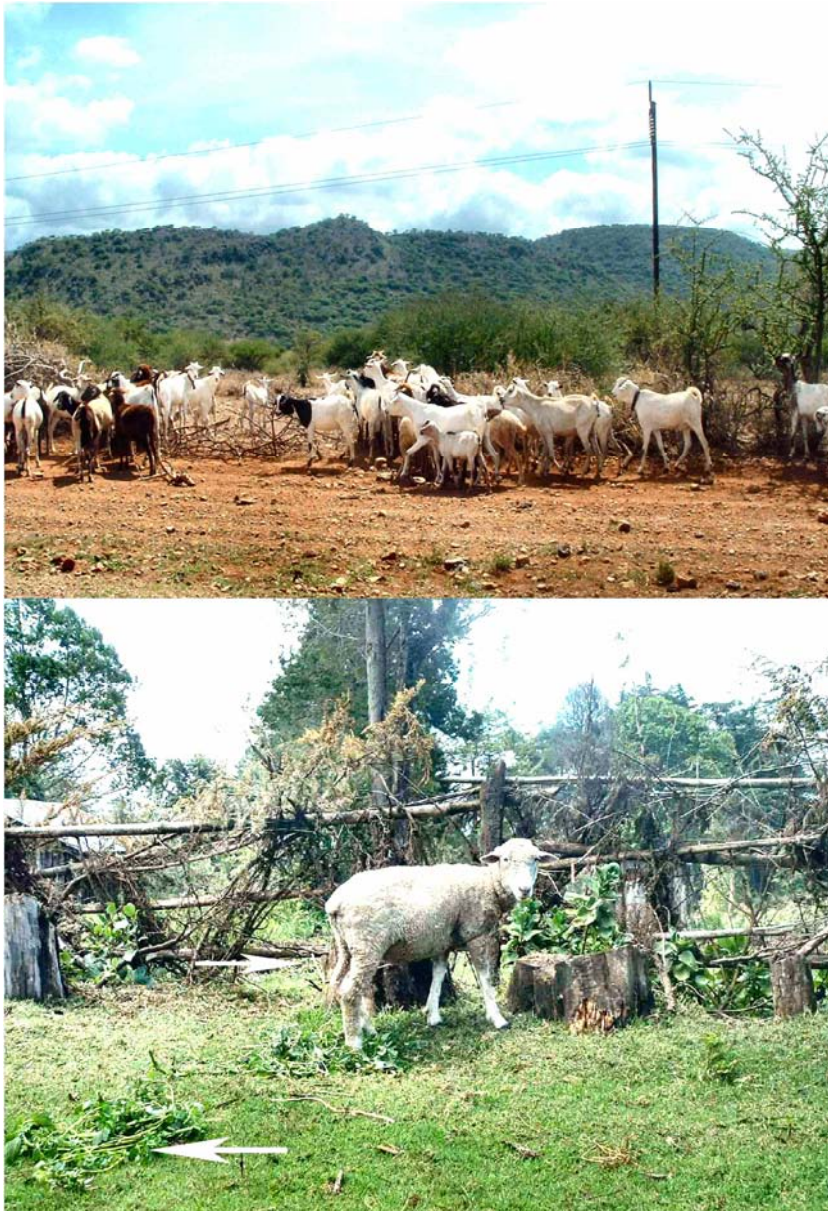
Fig. 2. Grazing management practices amongst pastoralists and SHF in Kenya. Top picture shows communal grazing of sheep and goats in pastoral flocks, and bottom is tethering of sheep (top arrow in bottom picture) owned by SHF. The sheep in the bottom picture is also supplemented with farm and household vegetable waste (lower arrow), while sheep and goats owned by pastoralists do not receive any supplementation.