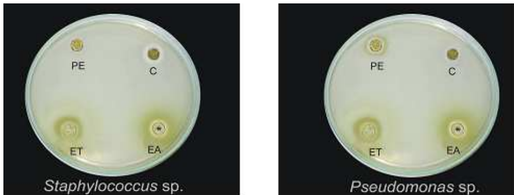
Figure 2 Inhibition of Staphylococcus sp. and Pseudomonas sp. by plant extracts of tender leaf of A. officinalis extracted in petroleum ether (PE), chloroform (C), ethyl acetate (EA) and ethanol (ET) using Soxhlet extraction method.