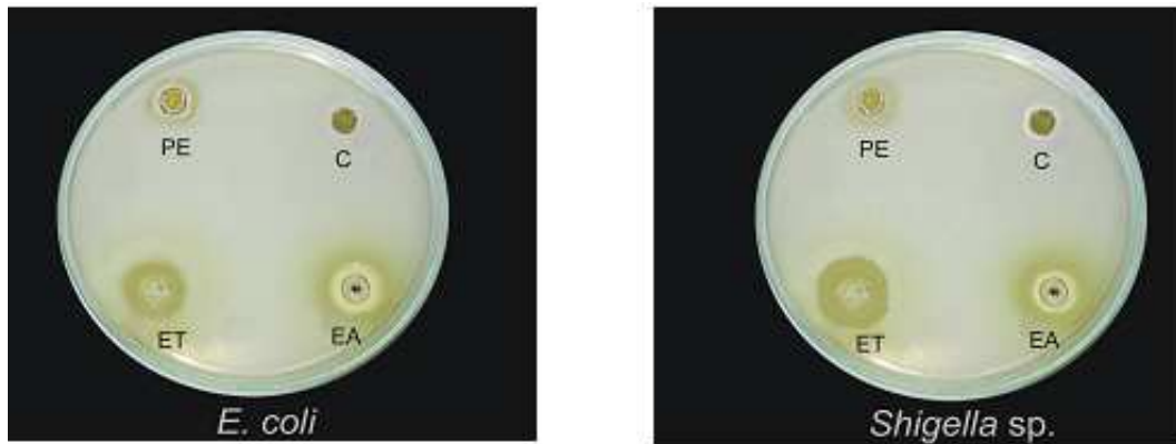
Figure 3 Inhibition of E. coli and Shigella sp. by plant extracts of bark of A. marina extracted in petroleum ether (PE), chloroform (C), ethyl acetate (EA) and ethanol (ET) using Soxhlet extraction method.

leaf extract of B. sexangula did not exhibit antibacterial activity against Pseudomonas sp. and bark extracts were unable to inhibit Staphylococcus sp (Table 2).