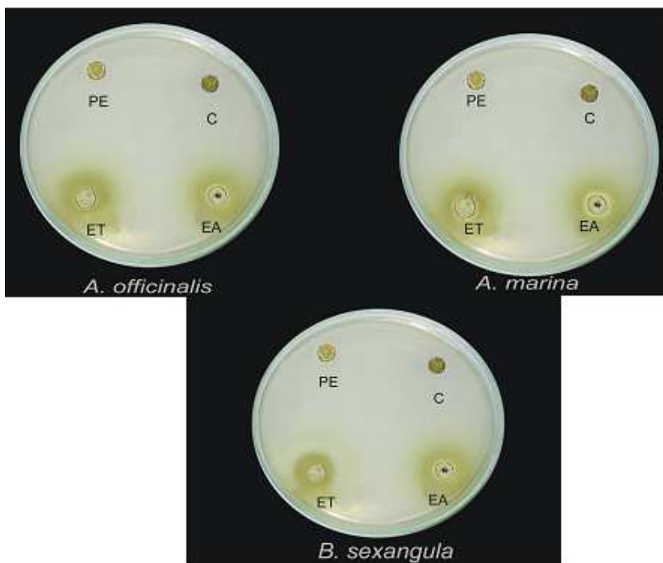
Figure 1 Inhibition of E. coli by plant extracts of mature leaf of A. marina , A. officinalis and B. sexangula extracted in petroleum ether (PE), chloroform (C), ethyl acetate (EA), and ethanol (ET) using Soxhlet extraction method.