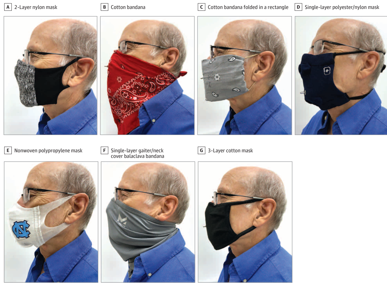
Figure 1. Consumer-Grade Masks and Improvised Face Coverings

The face coverings tested in this study included a 2-layer nylon mask with ear loops (54% recycled nylon, 43% nylon, 3% spandex), tested with and without an optional aluminum nose bridge and filter insert in place (A), a cotton bandana folded diagonally once “bandit” style (B), a cotton bandana folded in a multilayer rectangle according to the instructions presented by the US Surgeon