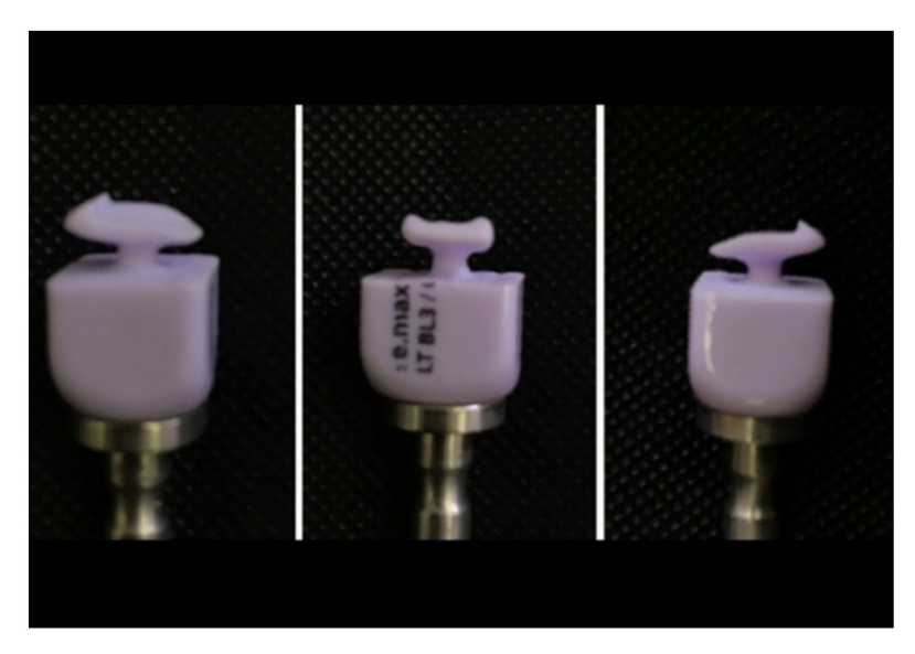
Figure 3. Milling the PLVs; IPS-Emax CAD blocks after milling.

Veneers were designed using a dental design software program (Exocad, Exocad GmbH, Darmstadt, Germany) and fabricated using lithium disilicate ceramic blocks (IPS-Emax CAD blocks, Ivoclar Vivadent, Schaan, Leichtenstein) with a five-axis milling machine (Ceramill® Motion 2, Amann Girrbach AG, Germany). The lug was cut off, and any irregularities were removed and polished using a low-speed fine diamond bur for each veneer (Meister Point, Noritake Inc., Nagoya, Japan) (Figure 3). All specimens were sintered according to the manufacturer's instructions.