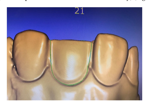
Figure 1. Veneer preparation on Ivorine typodont model and the corresponding digital scan.

Depth orientation grooves were prepared, followed by veneer preparation for a CLV restoration with a tapered diamond point and finishing stones. The reduction at the facial surface of the tooth was 0.4 mm in the cervical third with a chamfer finish line. The tooth preparation ended 1.0 mm occlusal to the cemento-enamel junction. At the middle and occlusal third, the reduction was 0.6 mm, with a butt joint incisal design to ensure the correct seating of the CLVs. The tooth preparation was performed interproximally without contact area removal.