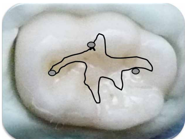
Figure 1. Areas of the molars upon which the measurements were performed.