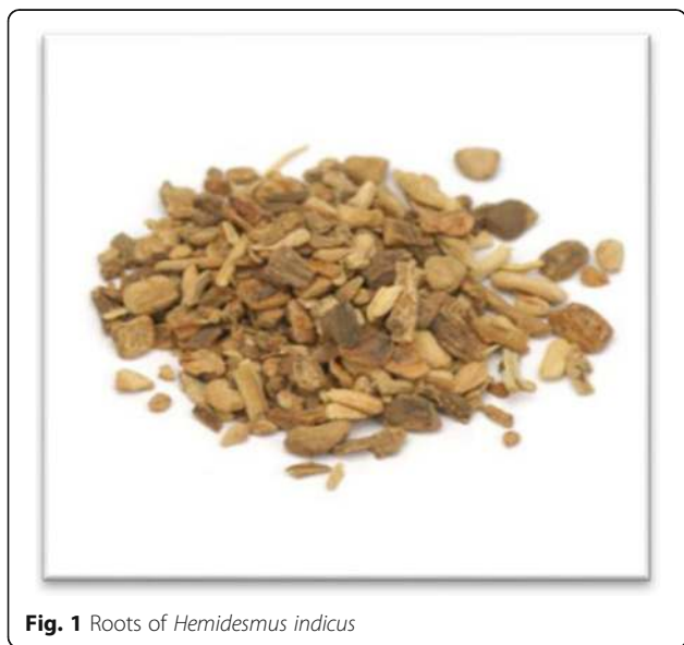
Fig. 1 Roots of Hemidesmus indicus

Streptozotocin, 2,2-diphenyl-1-p-picryl- hydrazyl (DPPH), ursolic acid and quercitrin hydrate were procured from Sigma Chemical Co. St. Louis, Missouri, USA. HPLC grade acetonitrile were purchased from Merck Chemicals, Mumbai, India. Pyrogallol, ethylenediamine tetra acetic acid (EDTA) and other chemicals and solvents of AR grade were purchased from Hi Media Co. Mumbai, India.