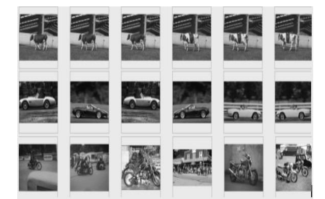
Fig. 3. Sample images from TUDarmstadt Dataset