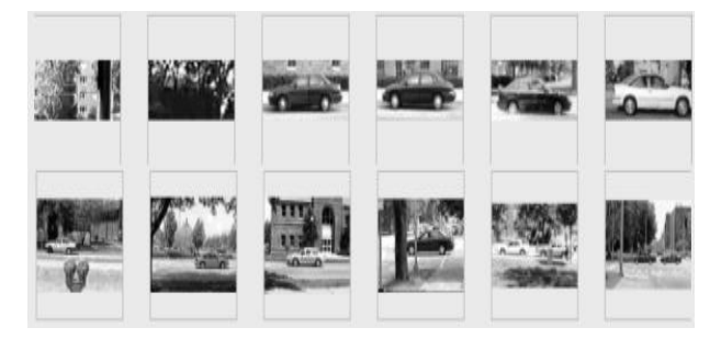
Fig.2. Sample Image from UIUC Dataset