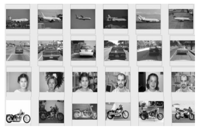
Fig. 1. Sample Image from Caltech Dataset

We used around 2570 images from five online standard datasets for the evaluation of both algorithms. Mostly in literature Caltech dataset is used for the evaluation of bag of features model, however this paper presents the evaluation results of both algorithms on four other datasets along with Caltech, providing a complete set of images to evaluate an algorithm's performance. These datasets include: UIUC. TUDarmstadt, VOC2005-1 and VOC2005-2. (Fig.1 to Fig.5) shows sample images from the Caltech, UIUC, TUDartmstdt, VOC2005-1 and VOC2005-2 datasets respectively.