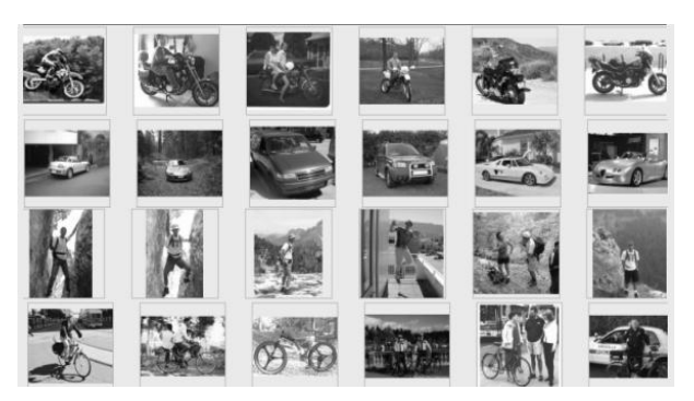
Fig.5. Sample images from VOC2005-2 Dataset