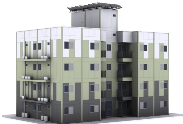
Fig. 2. Digital model of the multi-family building showing the solar panels oriented to north.