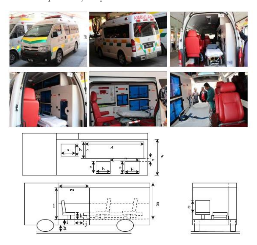
Fig. 1: Photographs and design specifications for Class B type ambulance

risk in the development of the MSDs with the assumption that the ambulance is in motion while the operation activity is in progress. Photographs and design specifications for Class B type ambulance commonly used in Malaysian public hospitals are shown in Fig.1.