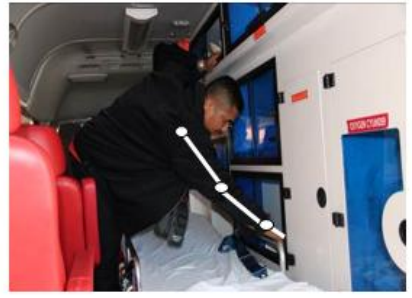
Fig. 4: EMS personnel is trying to get the medical equipment in the lower cabinet; the final REBA scores recorded is 10