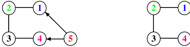
(a) The leader-following network graph. (b) The leaderless network graph.