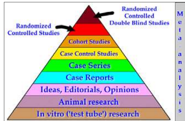
FIGURE 2. Types of research

cine is the growing number of examples, in which current medical practice cannot cope pace with the