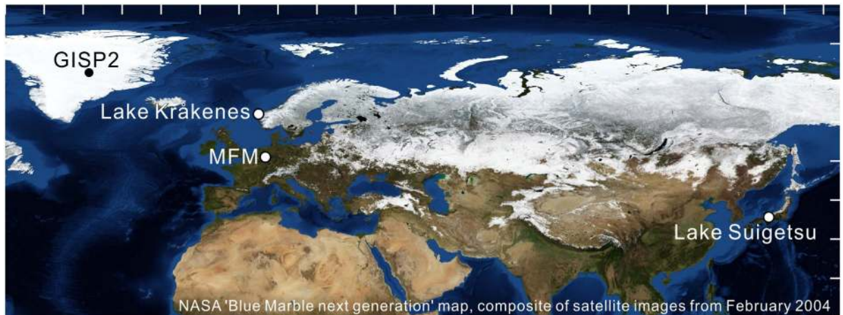
Figure 1. Location of Lake Suigetsu and sites referenced in the main text. Background map by NASA 35 , latitude and longitude scale resolution is 10°.

ice cores 9,11 , with higher values during the first phase of the YDS and lower values during the second, though the mechanism behind this change is uncertain 9 . The transition is not as distinct as in the other records due to a generally high variability, but occurred around 12.1 ka BP.