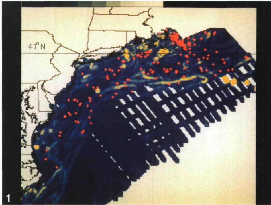
Fig. 1. Sighting positions (all seasons) for fin whales superimposed on an image of magnetic field intensity gradients over the outer continental shelf off the northeastern United States. Magnetic data are from the DNAG data set. Sighting positions from the CETAP dedicated aerial surveys are indicated by red crosses. Magnetic field gradients are indicated by shading, with 256 steps between minimum (blue) and maximum (yellow) gradients. The dark east–west line indicates latitude 41°N.