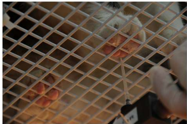
Figure 1. Photograph of the placement of the von Frey probe. During evaluation, the cats stood in a meshed cage, the probe tip was placed perpendicular to the plantar surface of the foot, and an increasing force was applied without manipulating the limb. doi:10.1371/journal.pone.0097347.g001

Repeated mechanical stimuli of sub-threshold intensity (that is, for which a single stimulus would not elicit pain behaviour) were applied using a purpose-made device (Topcat Metrology Ltd; Cambs, UK). Available protocols of TS in humans and animals were used to devise the stimulation set profiles used in this study [29–32], and the profiles were refined during a pilot study in three cats (2 with OA; data not shown). The device supplied repeated mechanical stimuli at a predetermined intensity, duration and time interval. The mechanical stimulus was produced by hemispherical-ended metallic pin (2.5 mm diameter, 10 mm length) mounted on a rolling diaphragm actuator, adapted from a validated mechanical threshold testing system [33]. The actuator was mounted on the anterolateral aspect of the right or left mid metacarpus, held by