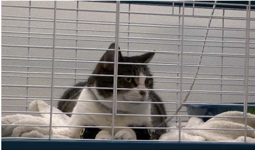
Figure 2. Photograph of the mechanical repetitive stimuli quantitative sensory testing experimental setting. Cats were placed in a meshed cage. The mechanical stimulator, which was embedded in a small band, was placed around the distal aspect of the cat's foreleg (left in this photograph) and connected to the stimulator device, while a dummy band was installed on the contralateral leg (right in this photograph). doi:10.1371/journal.pone.0097347.g002

a narrow band around the leg; a dummy was installed on the contralateral leg. During testing, the cats were free to move about in the same meshed cage (Fig. 2).