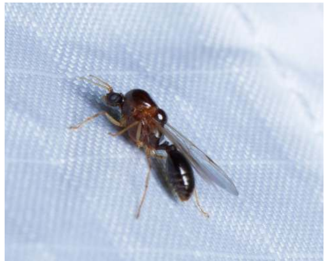
Fig. 4: Crematogaster sp. gyne after leaving the natal colony, making further dispersal decisions on the go. Note the big mesosoma with strong flight muscles.

Theoretically, colonizing new habitats is an important selection pressure for dispersal (VAN VALEN 1971, OLIVIERI & al. 1995). However, the time scale for such selection is long, because it plays out only when current habitat becomes unsuitable. Thus, selection for dispersal through the need for colonizing new habitats likely depends on selection for decreasing fitness variance in a lineage, rather than increasing immediate mean fitness (i.e., bet-hedging, STARRFELT & KOKKO 2012). Also the spatial scale of colonizing new habitats is large in ants: For central place foragers, even short-range dispersal is often enough to mitigate the harmful effects of kin com-