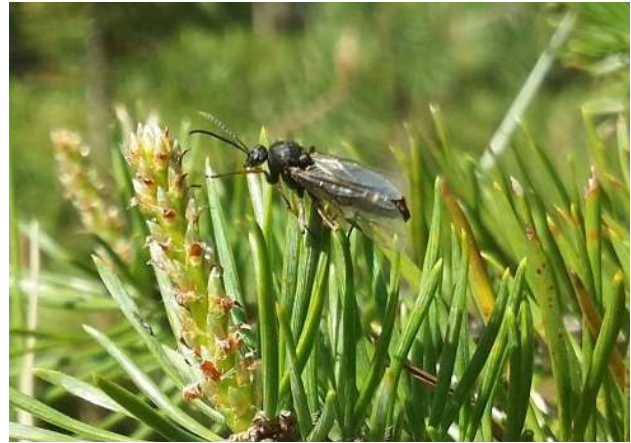
Fig. 1: Formica pratensis male has left the natal nest and climbed to a tree branch above it, ready to fly.

Dispersal strategies of ant males: Ant males are traditionally seen only as the vehicles of sperm, and not much more. Their role inside the colonies during their development has not evoked much interest (SCHULTNER & al. 2017), and their life outside the colonies is usually described by a single word: short. Ant males can potentially allocate all their resources to mating and dispersal, and do not need to invest in longevity, for example through costly immune defenses (BOOMSMA & al. 2005, STÜRUP & al. 2014). Detailed studies on male ants have focused on only a few species, such as Atta leaf-cutter ants (e.g., BAER & BOOMSMA 2006, STÜRUP & al. 2011). As male behavior and mating strategies vary a lot in other social Hymeno-