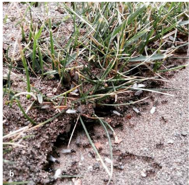
Fig. 3: (a) Lasius flavus gynes and workers have climbed on a rock above their nest. The workers of this subterranean species are rarely seen above ground except at the onset of dispersal. (b) Lasius niger males emerging from their nest.

of rearing workers (LINKSVAYER 2015). In a cross-rearing experiment on Solenopsis invicta , the origin of rearing workers seemed to affect larval development even more than the genetic background of the larvae, which would suggest great worker power (KELLER & ROSS 1993), whereas in a cross-rearing experiment on Temnothorax curvispinosus (MAYR, 1866), there were direct (the genotype of the individual itself), maternal, and worker effects on the gyne's mass at maturation, and direct and worker effects on the male mass (LINKSVAYER 2006). It seems that the development of larvae is an outcome of both their own phenotype and their social environment (FJERDINGSTAD 2005, LINKSVAYER 2015, SCHULTNER & al. 2017).