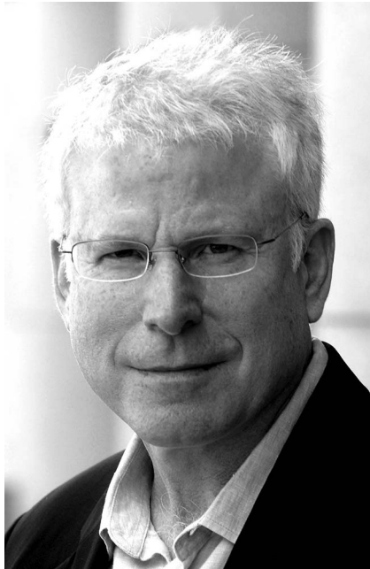
David M. Buss

gressive (even if not nonlethal) strategies. Employing cost-benefit analyses here can yield nuanced hypotheses about the design features of the psychological adaptations that evolved to deal with the adaptive problem of such aggressive conspecifics. Specifically, an aggression researcher could consider the shifting costs and benefits to the organism of failing to detect cues to such aggression when (a) the organism is injured or its ability to physically defend itself is otherwise impaired, and (b) when the organism is in the presence of vulnerable kin, or (c) alternatively, in close proximity to physically formidable kin or allies. A researcher can use this idea—that the costs and benefits of different responses to aggression would have been context-dependent—to generate the novel hypothesis that a key design feature of humans' psychological adaptations for dealing with aggressive conspecifics is sensitivity to these contextual cues.